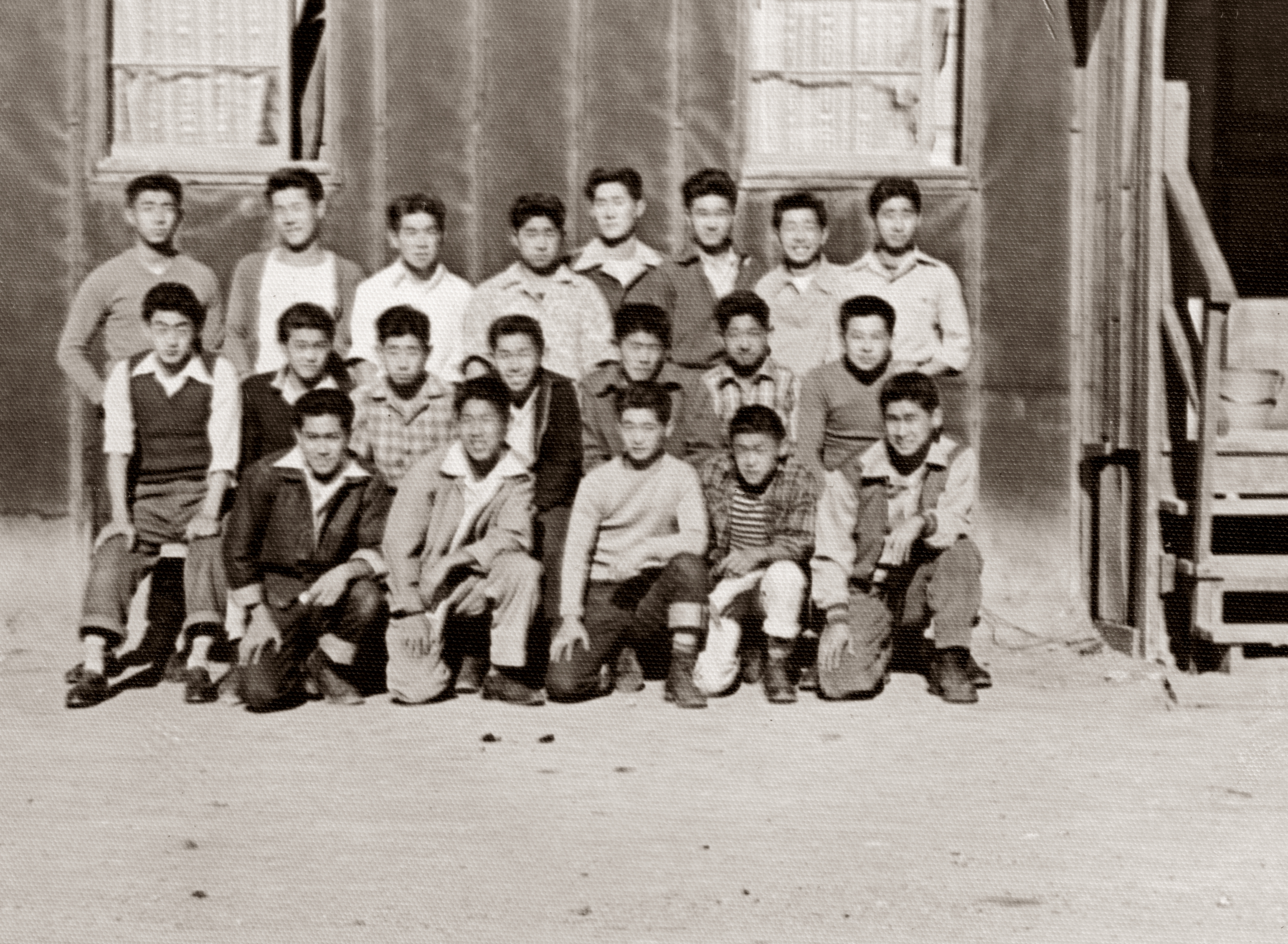
Cherokee Boy's Club, Heart Mountain, WY., circa 1943-1944. Held inside Block 23, Barracks 15, Room C