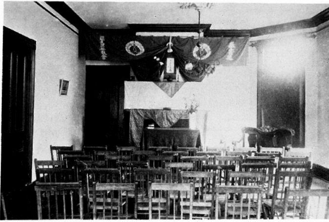
Chapel at 1630 Park Street