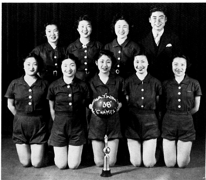
YWBA Basketball Team—1938

During this period and following, under the vigorous leadership of Revs. Chisei Shinohara, Koryu Iino, Shojin Taguchi and Joshin Motoyoshi, a total of seven Sunday Schools were established under the auspices of the Temple. In the 1930's the Temple flourished and, by 1936, the number of Sunday School children affiliated with the Temple numbered 560. Full participation was undertaken by them in all religious and church-related activities at the local as well as Bay District level. These included devotional meetings, conferences and various sports activities (the Alameda Girls' Basketball Team having the distinction of capturing several Bay District championships). As in most other Buddhist churches during this period, the policy-making body of the Temple was made up mostly, if not entirely, of the Issei members. However, the Nisei members, still in their teens and early twenties, were becoming active in the local and Bay District Temple activities.