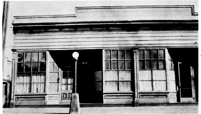
1630 Park Street 1912-1914

beginning of the Buddhist Temple of Alameda. This first location was on the main (business) street in Alameda and conveniently situated so as to be accessible to the Issei Buddhists, the majority of whom lived in the proximity of the business district.