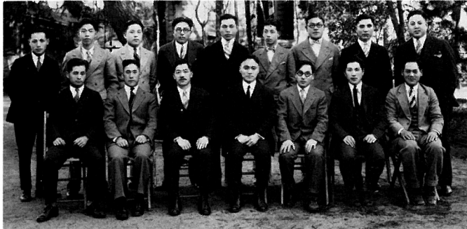
Young Men's Buddhist Association—1925

A private home near the mansion and situated on the same grounds was eventually purchased to serve as a residence for the minister and his family. With this latter acquisition, the second floor of the Temple was remodeled into conference or meeting rooms for the Young Men's Buddhist Association (YMBA) and the Young Women's Buddhist Association (YWBA). The entire building thus was used exclusively for Temple activities.