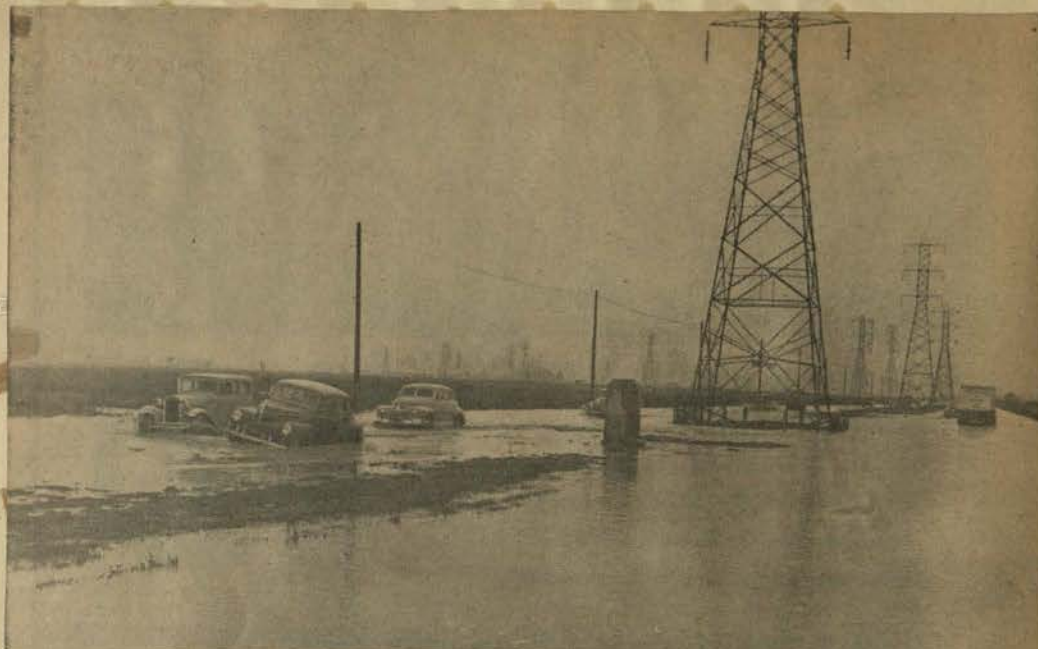
WATER stood hub-deep over a large area in the vicinity of 220th st. and Avalon Blvd. early today. In some sections defense workers were stranded when their cars were unable to ford streams and lakes that blocked roadways.