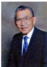
Sus Mori '45