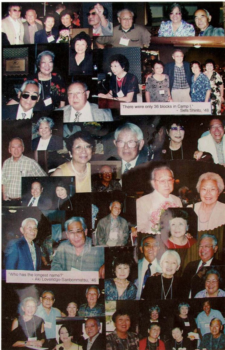
There were only 36 blocks in Camp 1. - Sets Shinto, '48