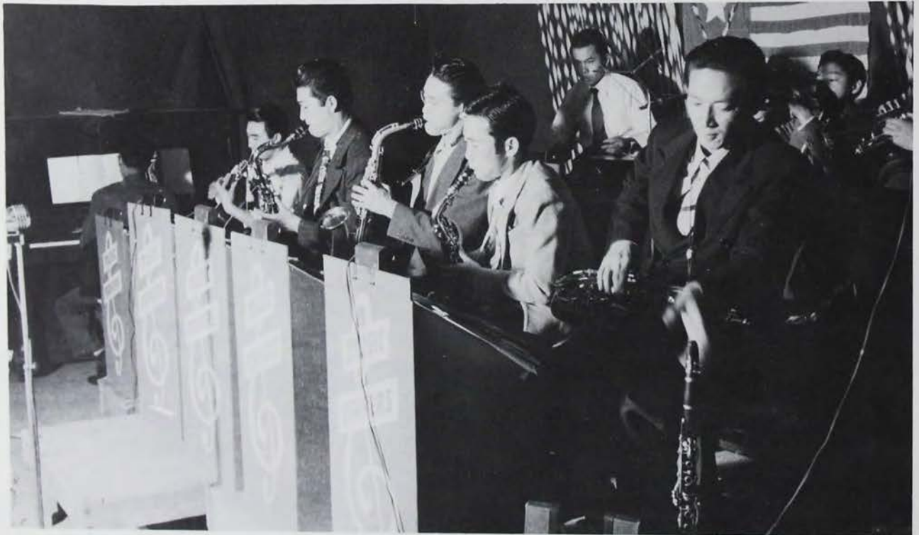
The Music Makers