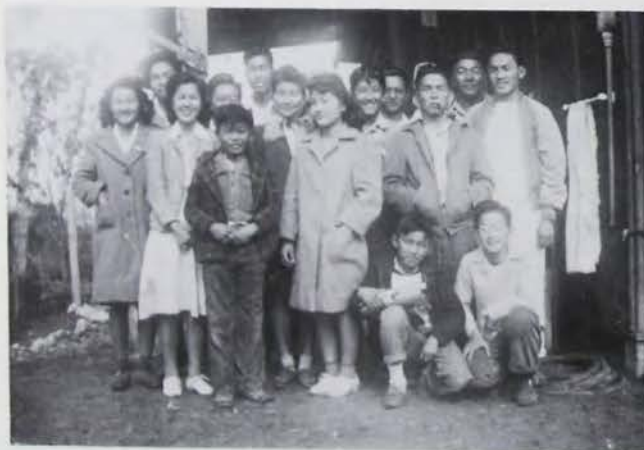
Young residents of block 19