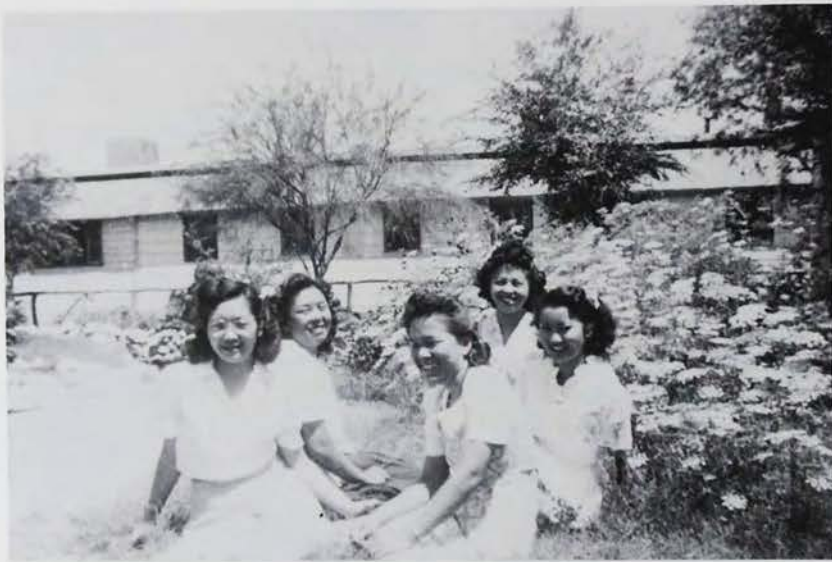
Administration Building workers