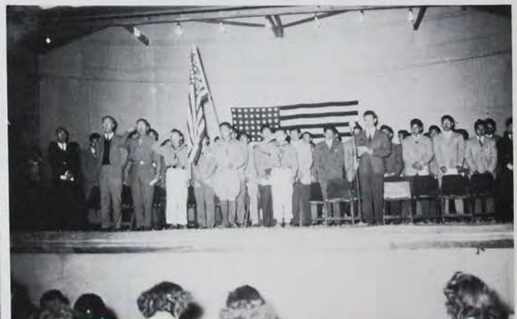
Boy Scouts army send-off