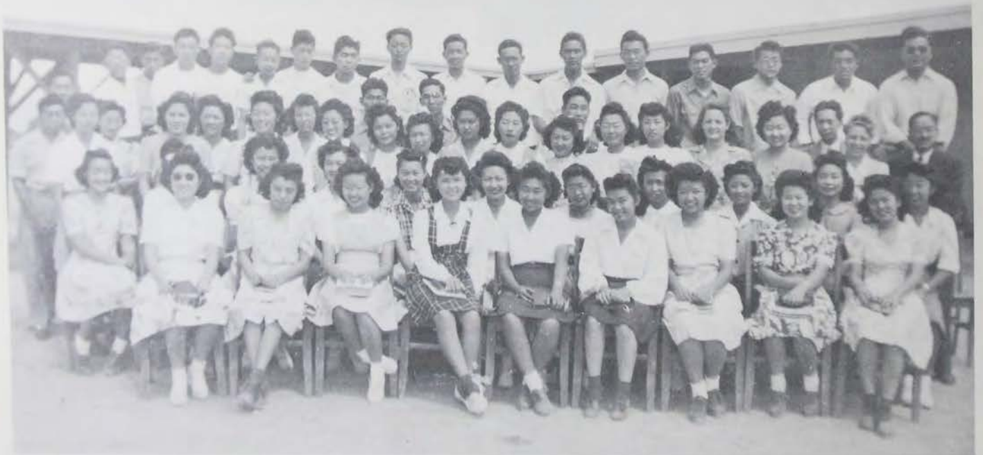
Christian Church Group