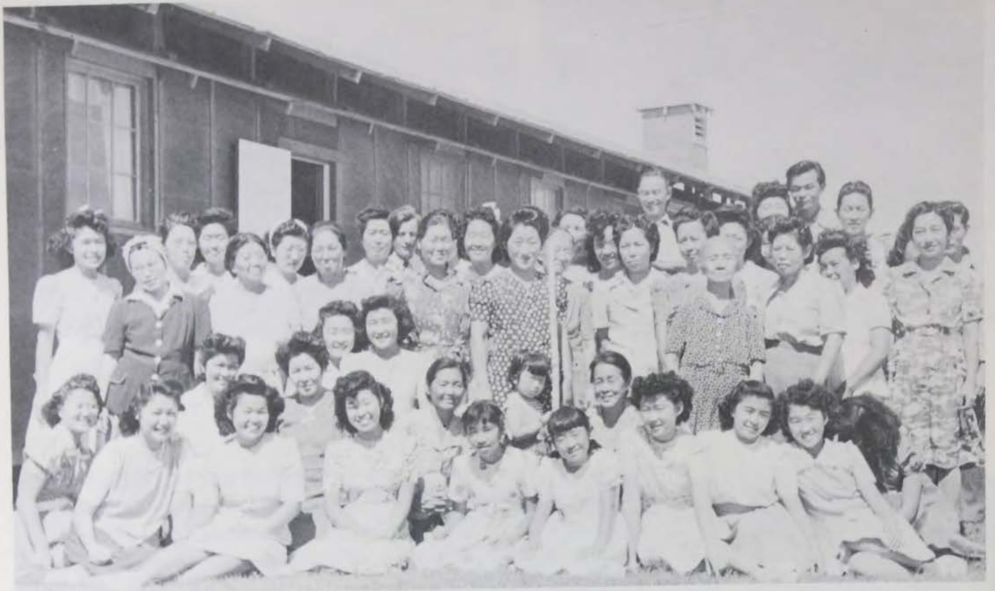
Photo taken on Mother's Day, 1944, at Maryknoll Chapel