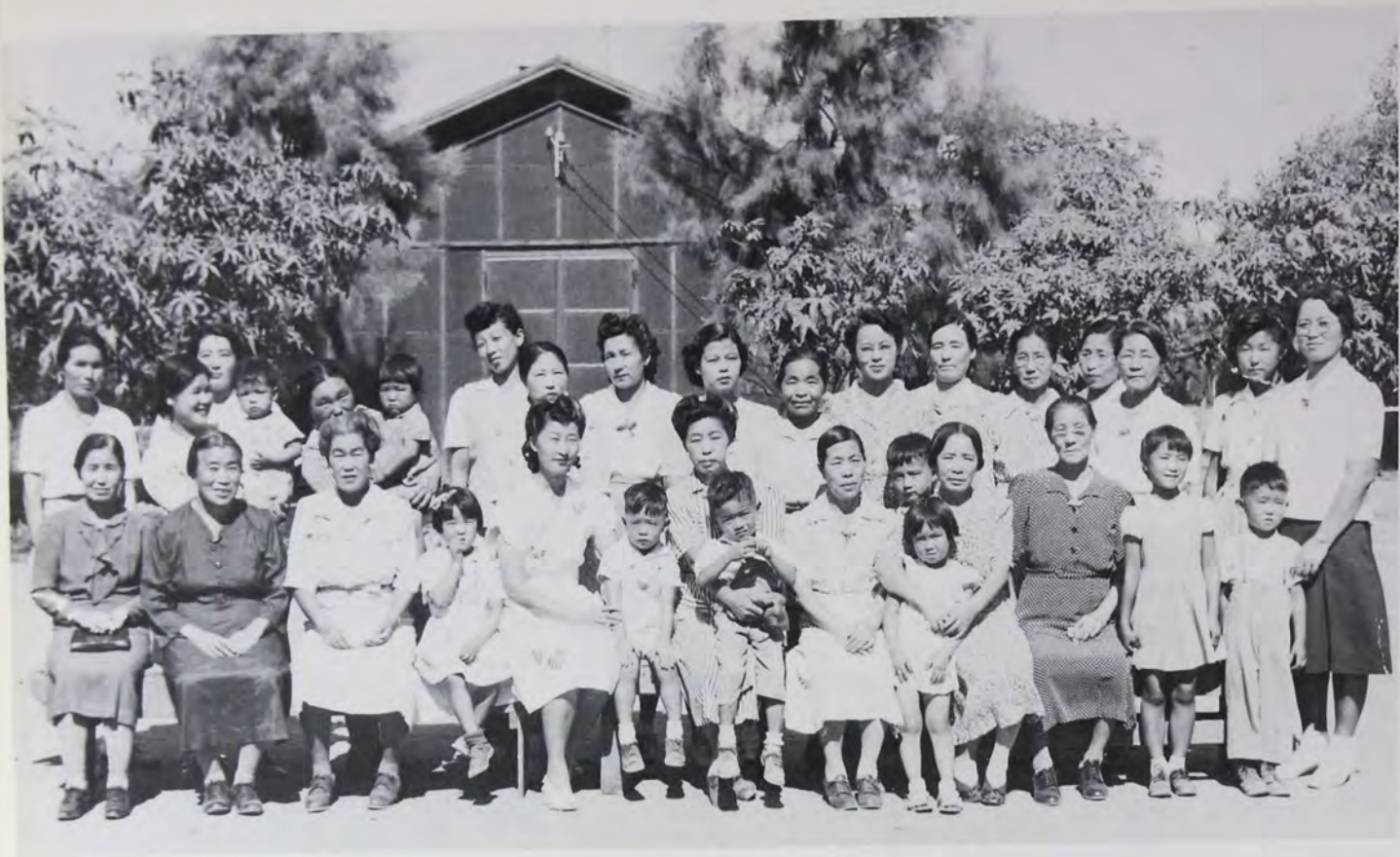
Block 44 ladies with young ones, August 1945