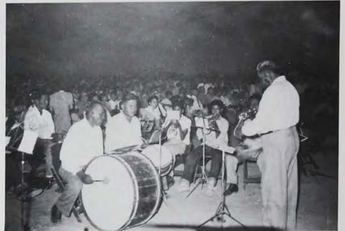
Local Indians at Poston I