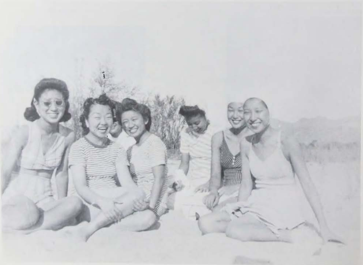
A day at the Colorado River (California Mountains in background)