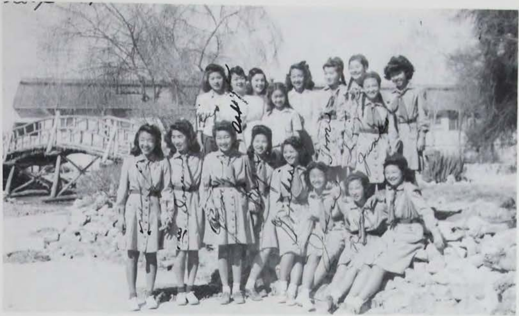
Girl Scouts - Troop 14