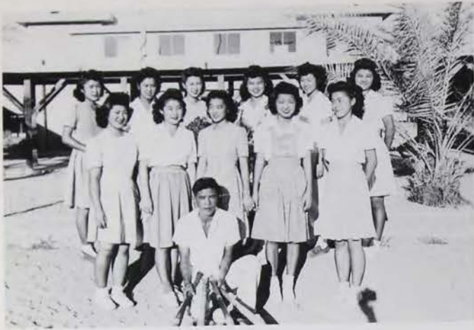
Girls softball cuties