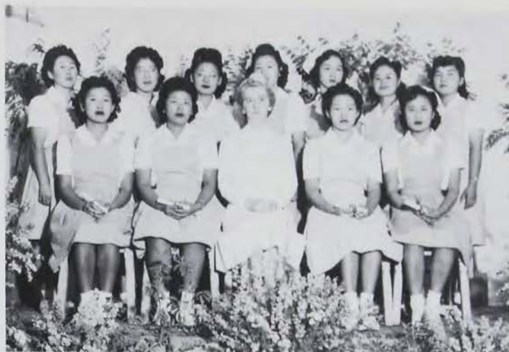
First graduating class of Nurses Aides, May 3, 1943