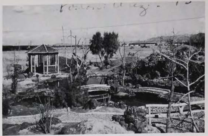
Block scenic pool