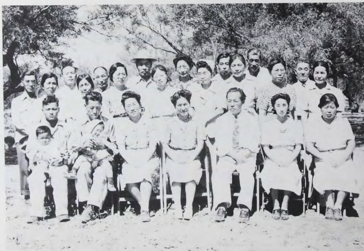
Bird Making Class