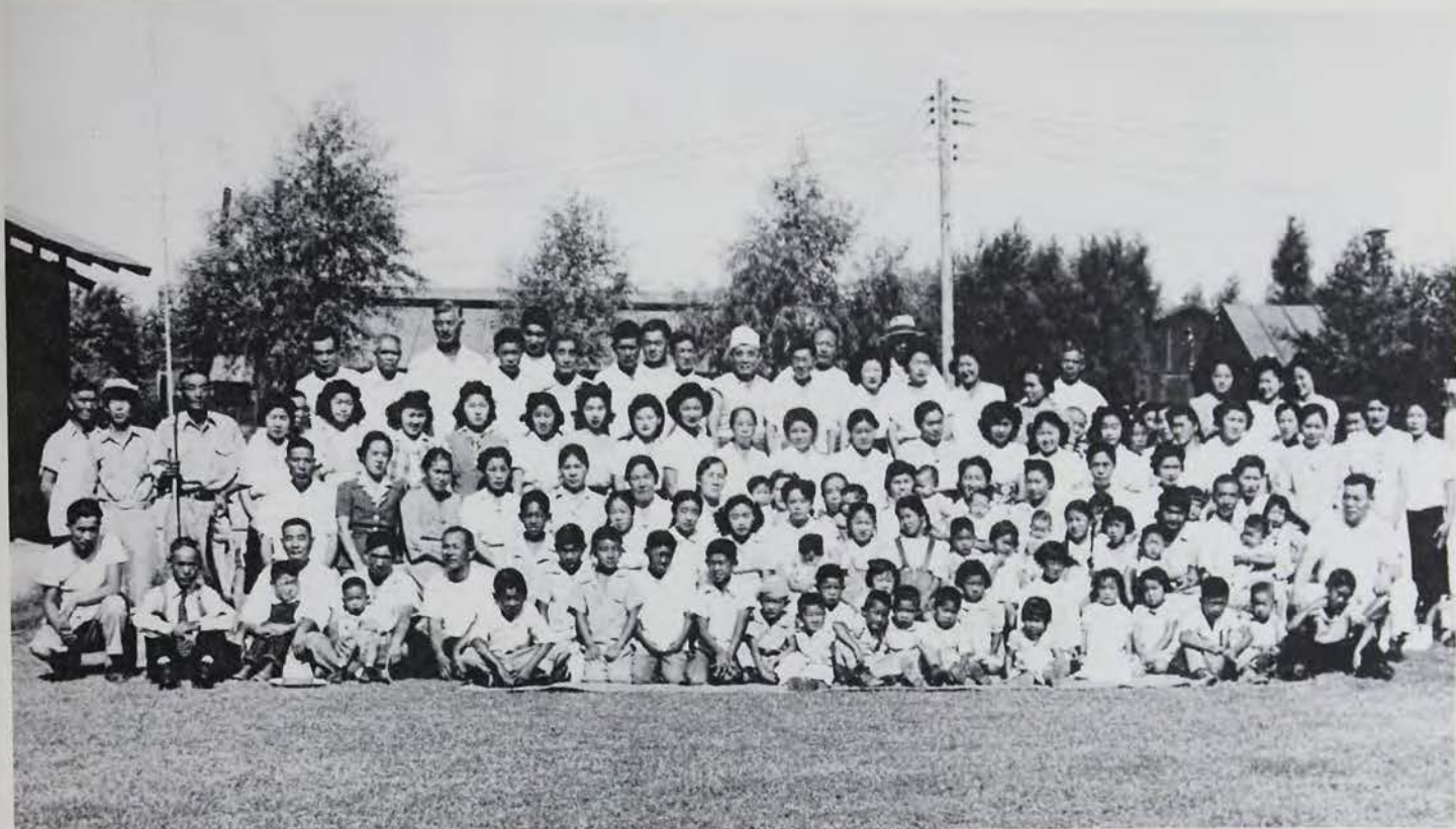
Residents of Block 28