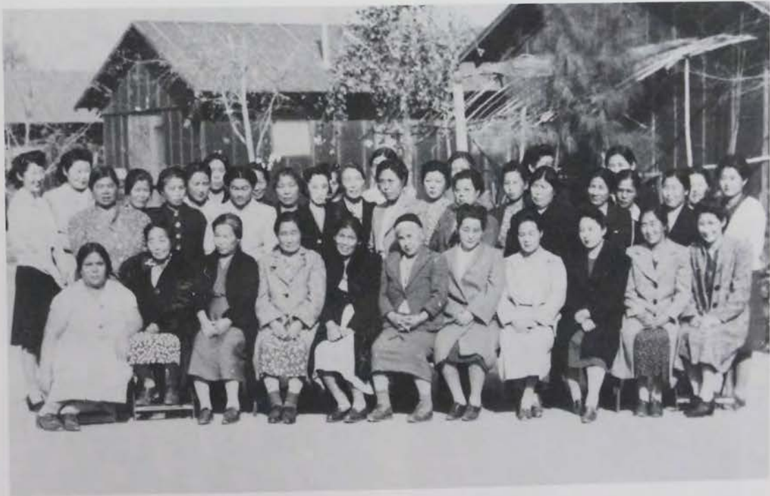
Block 46 Mothers