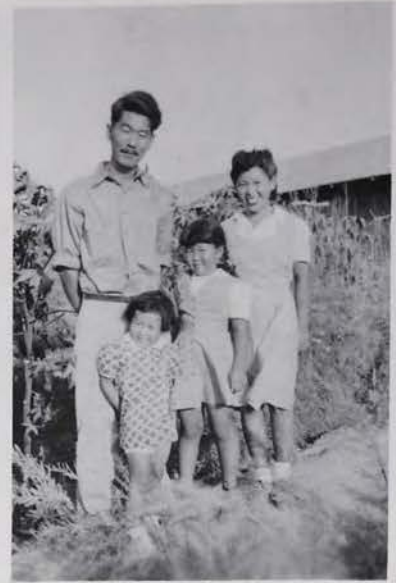
Inouye family, block 19