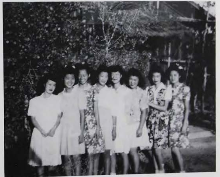
Block 46 Girls