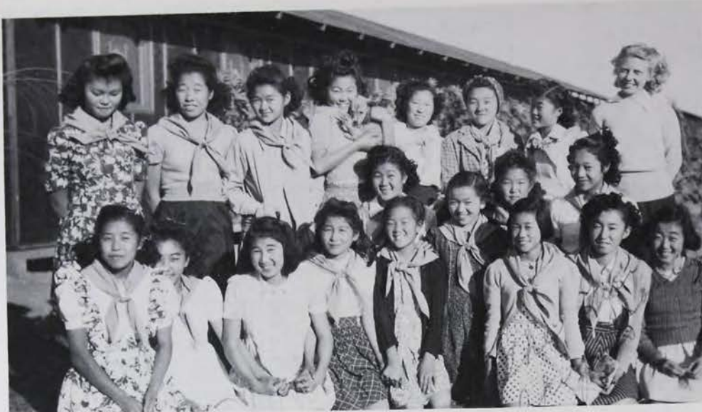
Girl Scouts, January 1, 1944