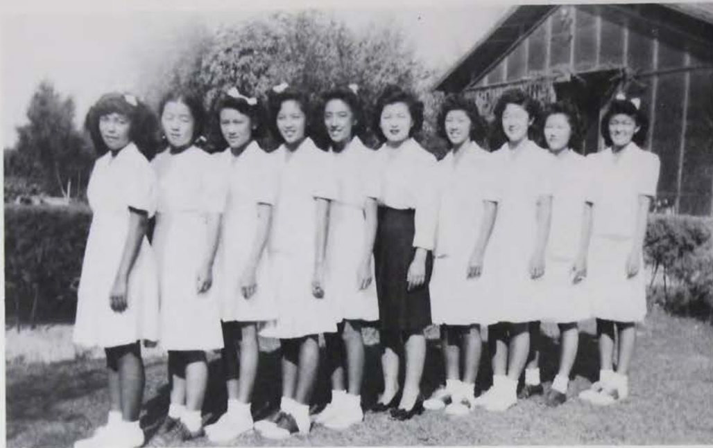
Block 30 - "Jr. Coeds" - 10-44