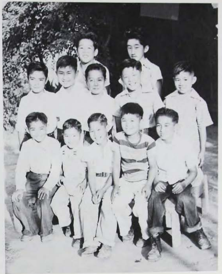
Block 2 Gang