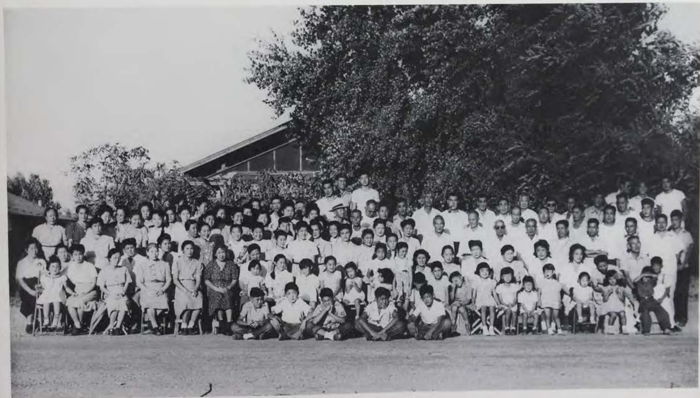
Residents of Block 59