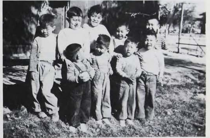
Block 14 "Yogores"