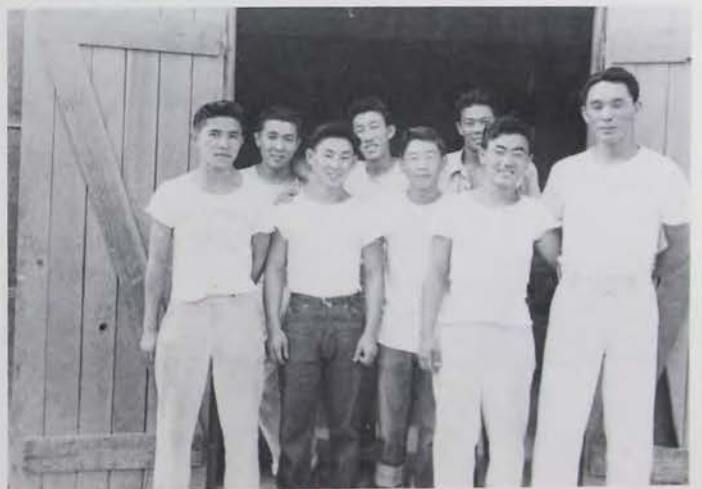
Block 43 "Ramblers"