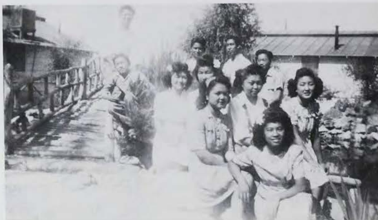
Block 19 Bridge