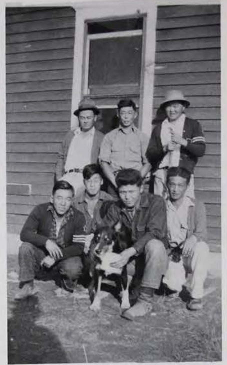
Block 31 Residents