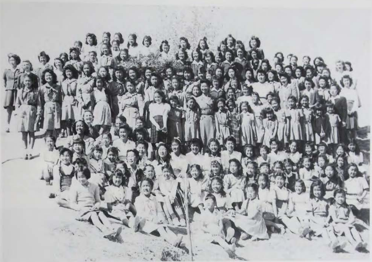
Girl Scouts of America, Poston