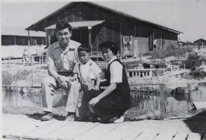
Ekimoto family, block 19