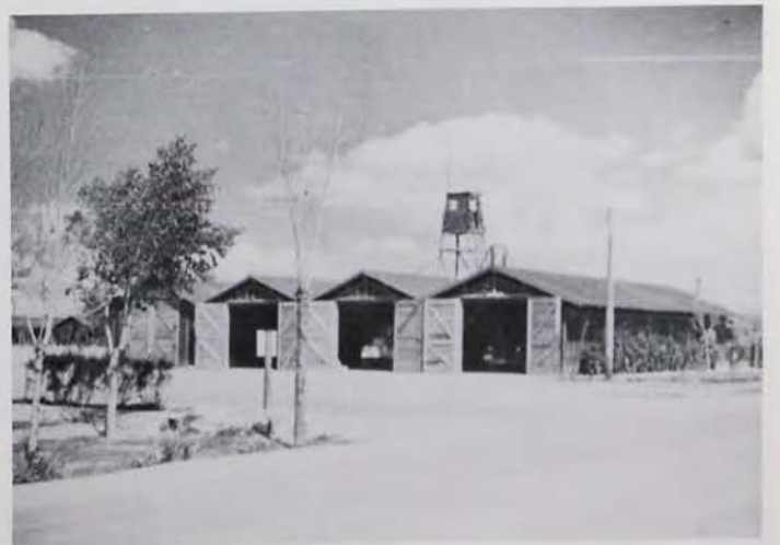
Poston I Fire Station