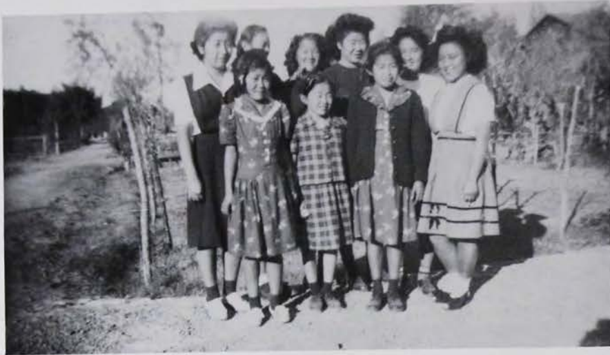
Kids of Block 43