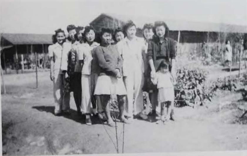
Block 30 Residents