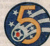
5th Air Force