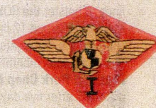
1st Marine Aircraft Wing