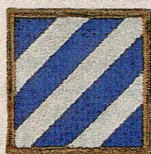
3rd Infantry Division