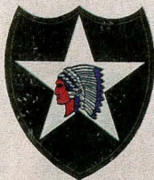
2nd Infantry Division