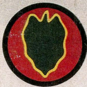
24th Infantry Division