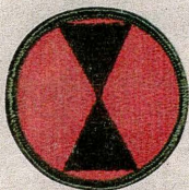
7th Infantry Division