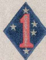
1st Marine Division