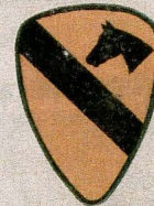
1st Cavalry Division