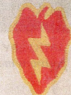
25th Infantry Division