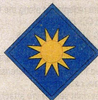
40th Infantry Division