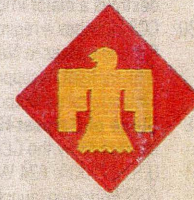
45th Infantry Division