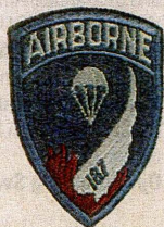
187th Airborne Regimental Combat Team

SOURCE: Battle Casualties of the Army, 30 September 1954 (Office Assistant Chief of Staff, G-1, Dept. of the Army) and other sources.