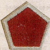
5th Regimental Combat Team