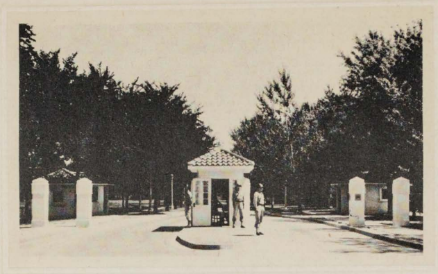
FITZSIMONS GENERAL HOSPITAL DENVER, COLORADO