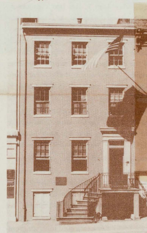
House Where Lincoln Died, 453 (now 516) Tenth Street NW.

Abraham Lincoln; From His Own Words and Contemporary Accounts, National Park Service Source Book Series Number 2, 20 cents a copy.