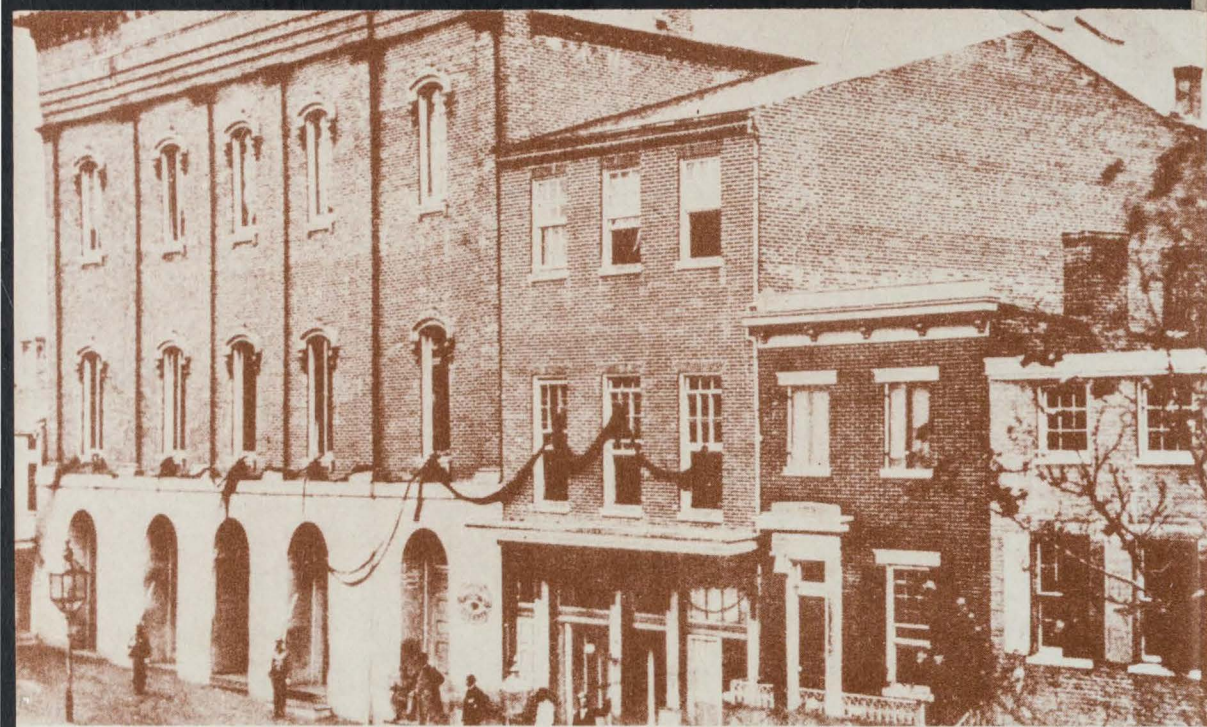
Ford's Theater after the assassination. Guards stationed outside the closed building.