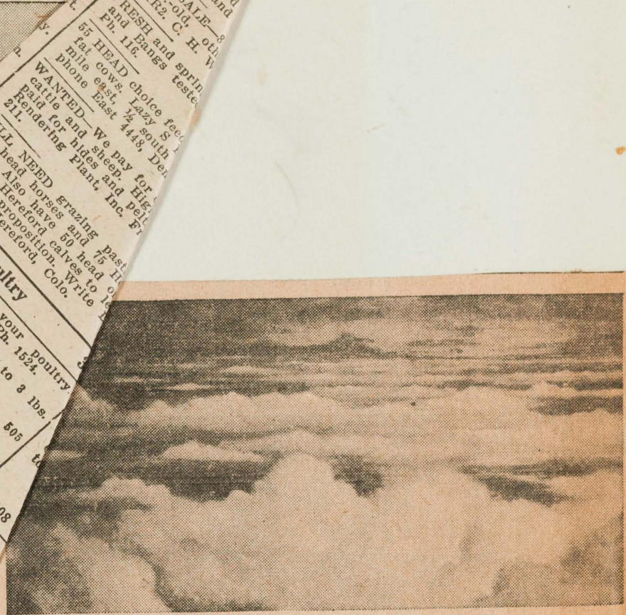
"Where neither lark nor even eagle flew," from a poem by a Canadian flyer who died in an air crash, inspired the above famous new English painting by C. R. W. Nevinson, A. R. A. "Battlefields of Britain." It has been given to the nation.