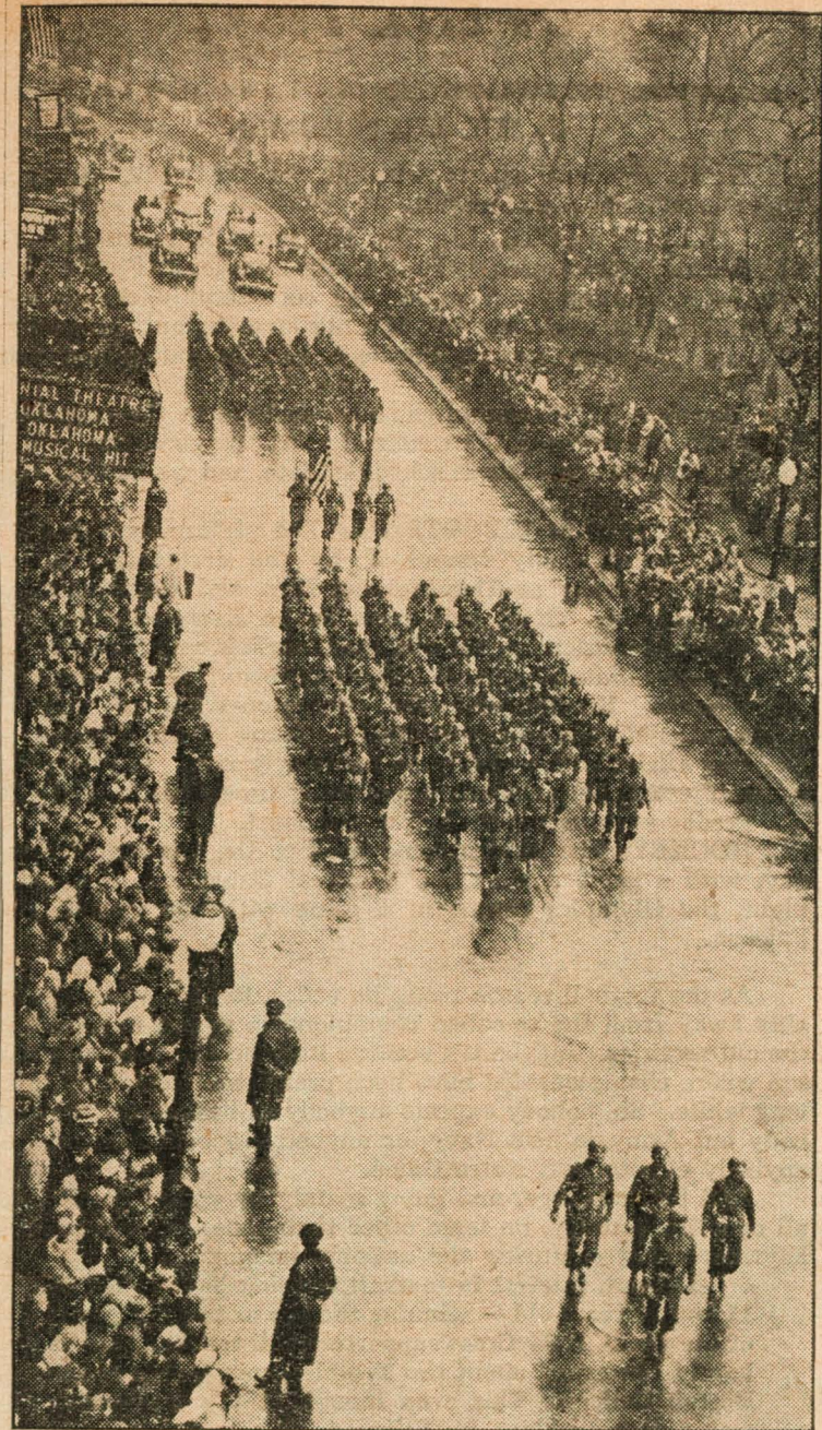
GUARD OF HONOR . . . Swinging down Boylston street in Boston's Armistice Day parade, the 804th MP Bn. from Ft. Devens escorts Gen. Dwight D. Eisenhower, Supreme Allied Commander.