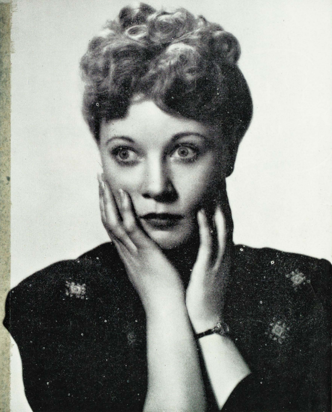
UNA MERKEL — in — "THREE IS A FAMILY"