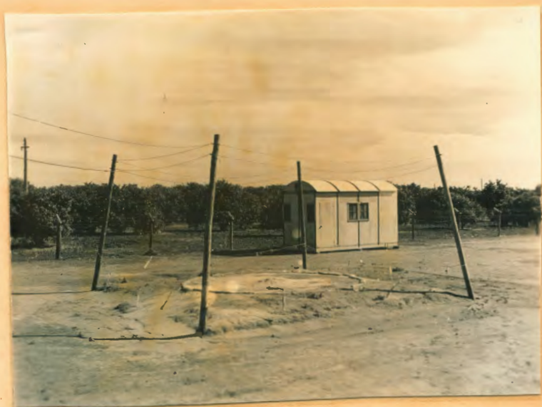
"Sumio" Wrestling Ring