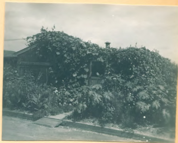
He built a porch and covered it with vines.