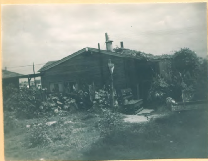
There was A German internee who lived in this house