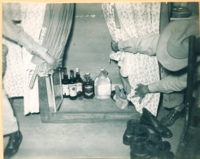
And had liquor to sell his friends.

The home was raided by the officials, He was sent to a male camp, placed in the camp jail for thirty days, he rejoined his family at the time they were repatriated to Germany.