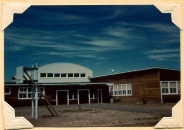
German Recreation Hall