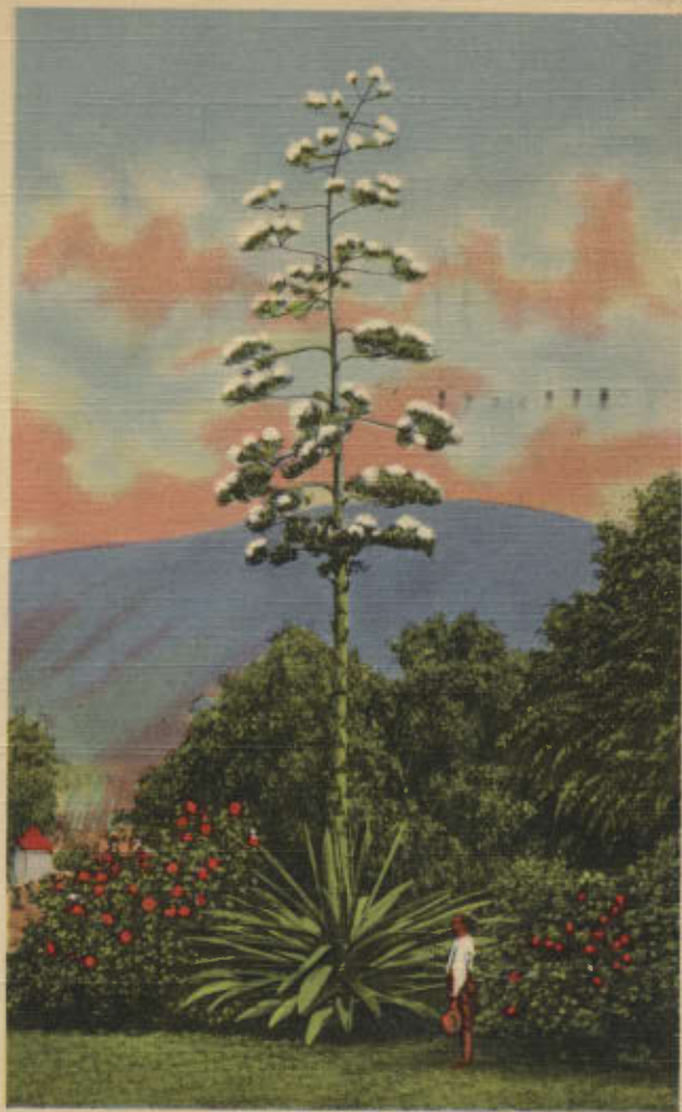
H-3139 CENTURY PLANT IN BLOOM, CALIFORNIA