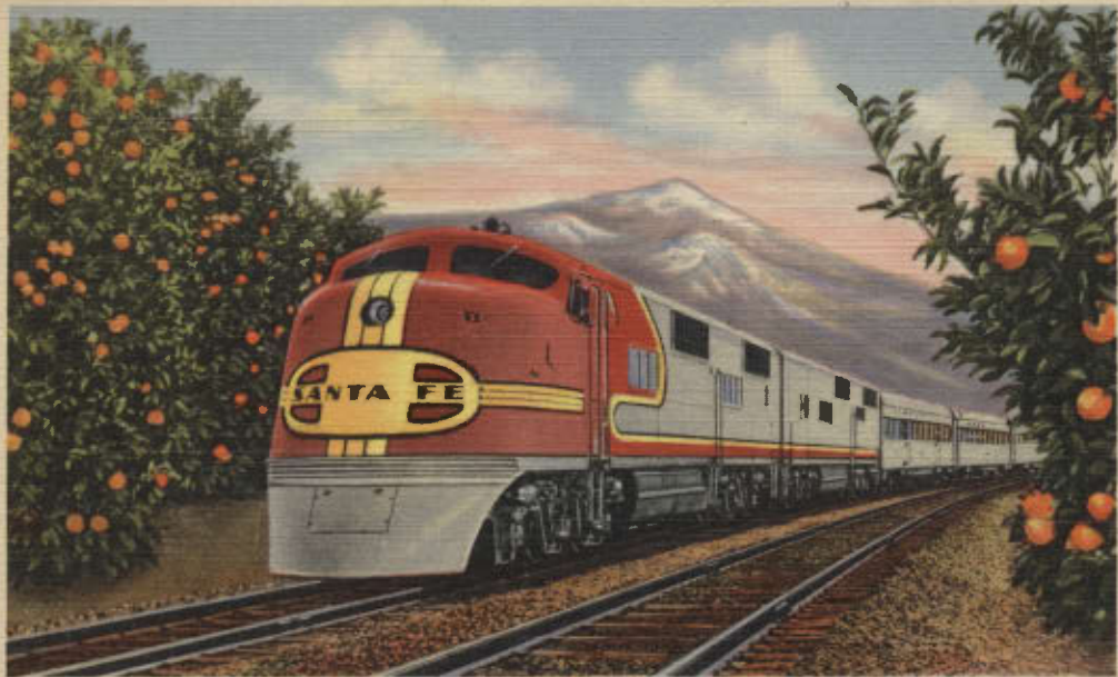
H-2290—SANTA FE STREAMLINER ENTERING SOUTHERN CALIFORNIA, THROUGH THE ORANGE GROVES