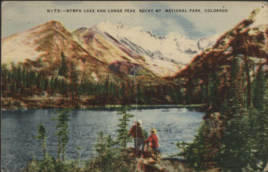
N173:—NYMPH LAKE AND LONGS PEAK. ROCKY MT NATIONAL PARK. COLORADO