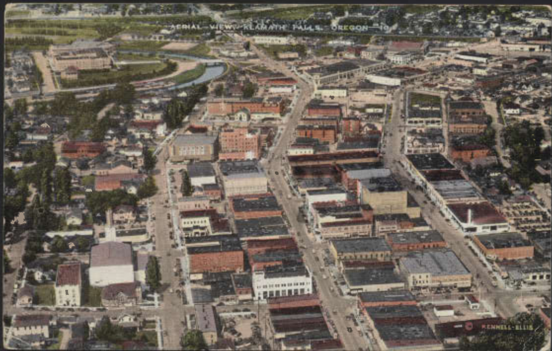
AERIAL VIEW, KLAMATH FALLS, OREGON