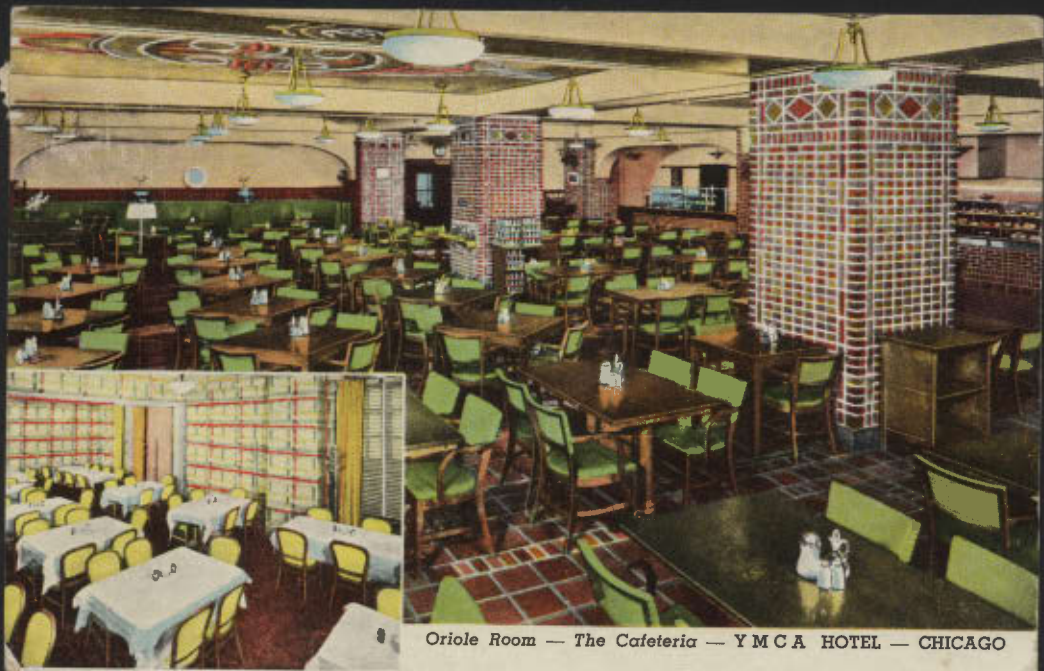
Oriole Room — The Cafeteria — Y M C A HOTEL — CHICAGO