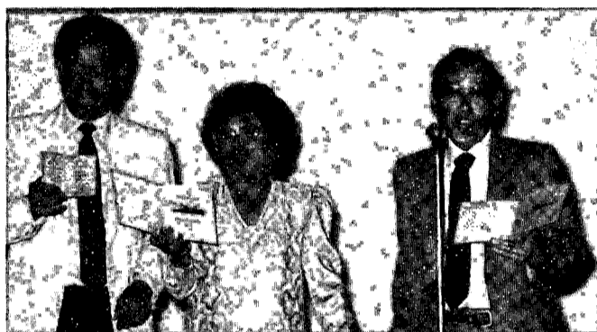
Sayonara Dinner Dance