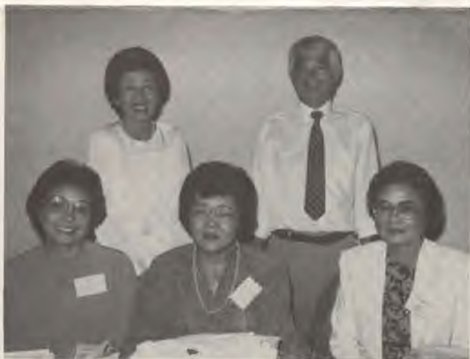
Part of Registration Committee

Others traveled from Georgia, Japan, Maryland, Minnesota, New Jersey, Florida, North Carolina, Nevada, Ohio, Pennsylvania, Texas, Utah and Wisconsin.