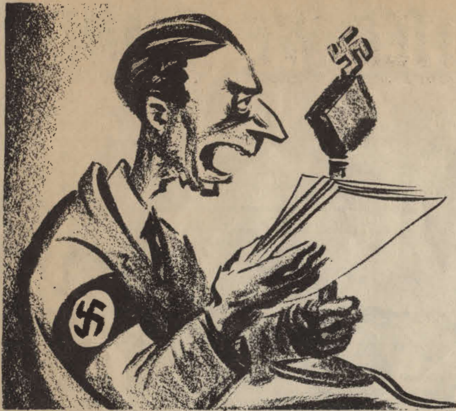
What Hitler Wants Us to Believe

Hitler propaganda wears a thousand false faces. It never announces itself as "Nazi." It appears where least expected, and under the most innocent auspices, often turning up as the latest funny story told during lunch.