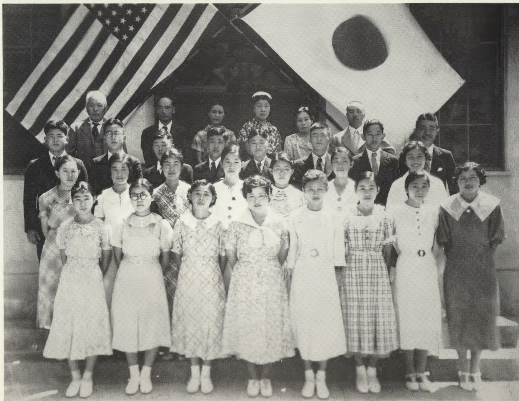
Marysville Gakuen Students -- Circa 1930