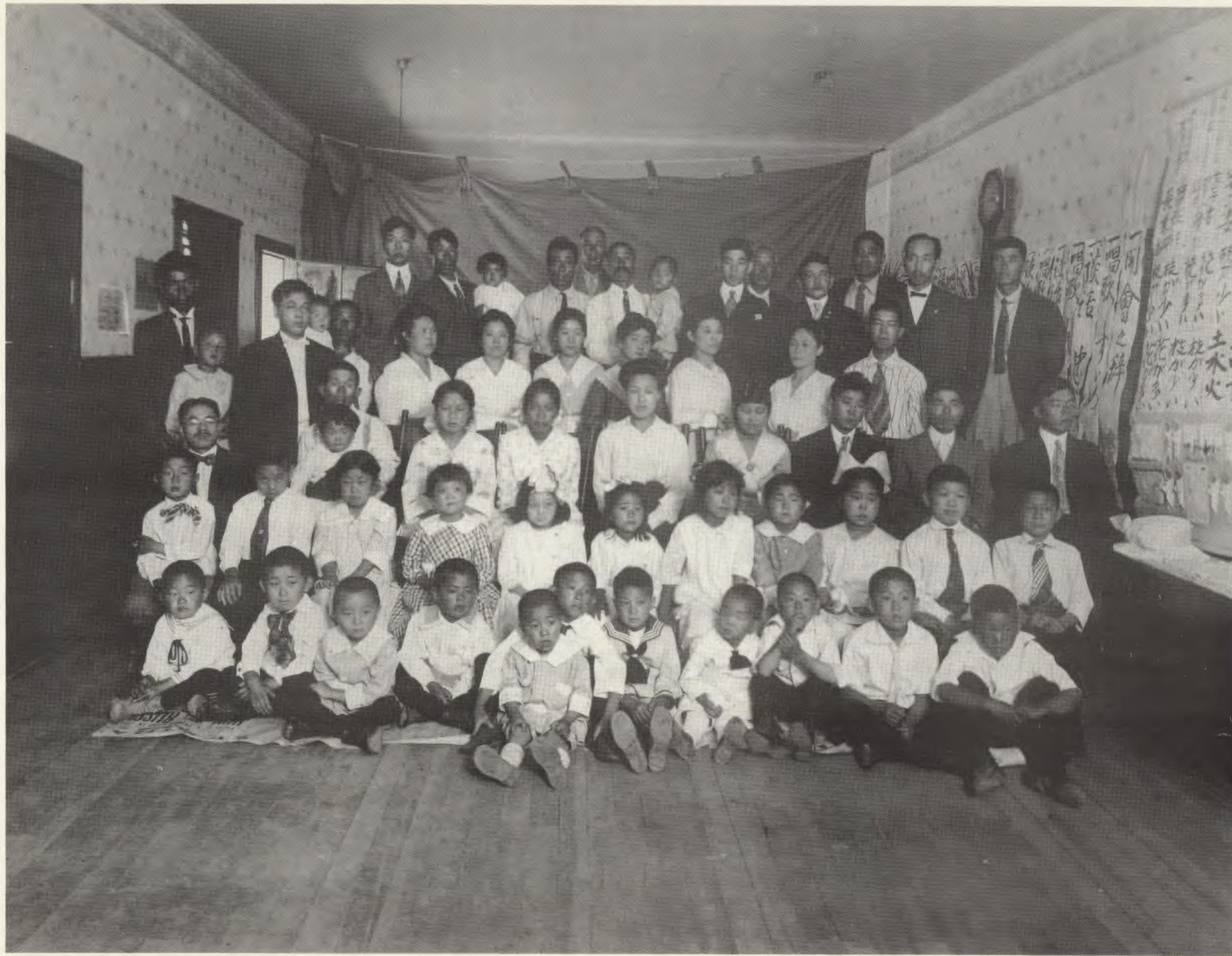
Pupils and Parents of Marysville Gakuen -- Circa 1918