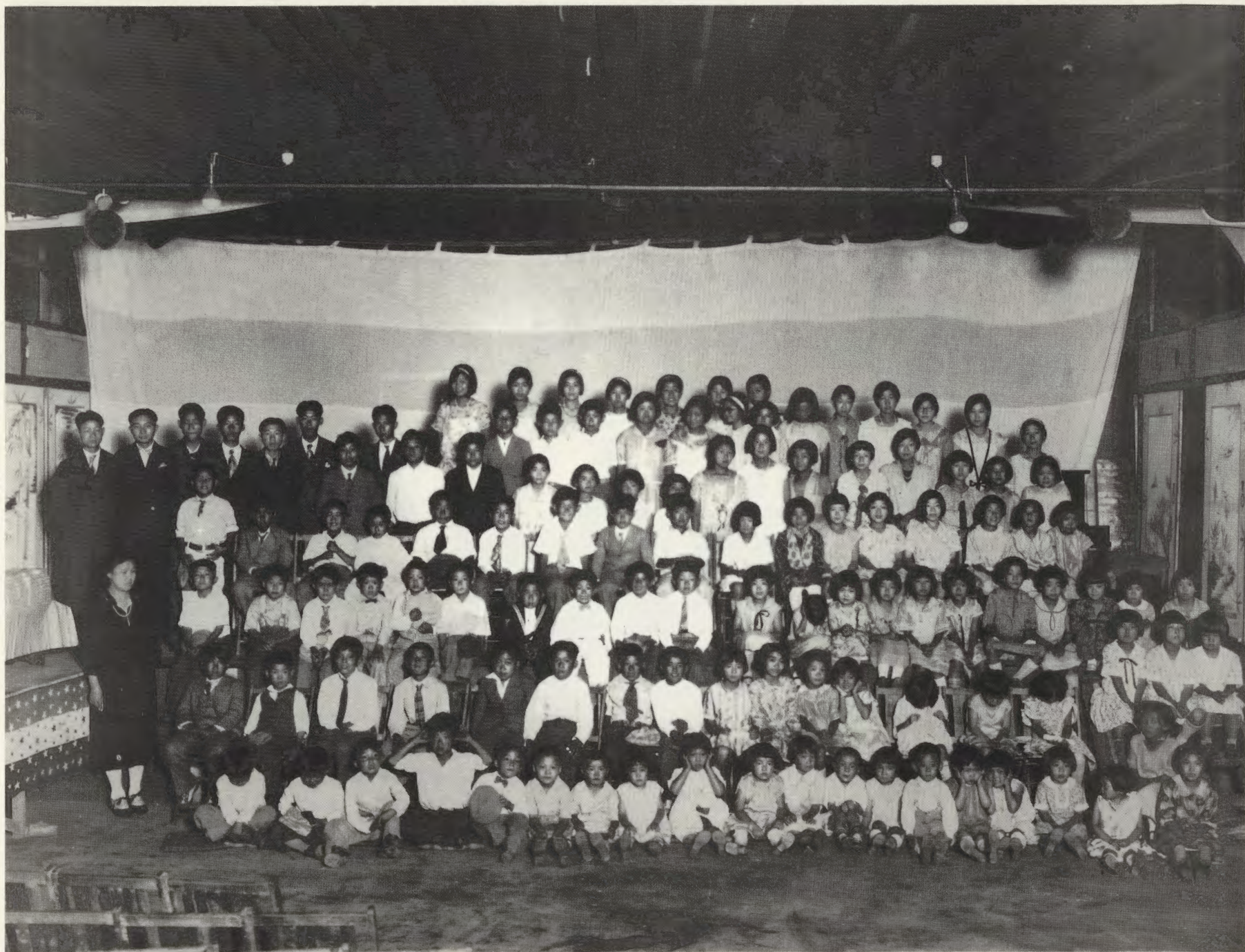
Marysville Gakuen Students -- Circa 1927