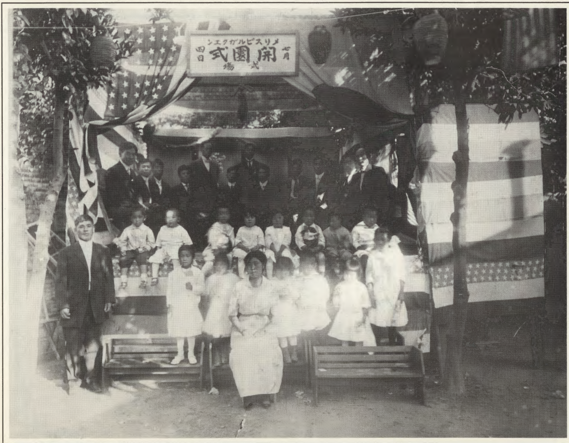
Japanese Gakuen -- Circa 1915