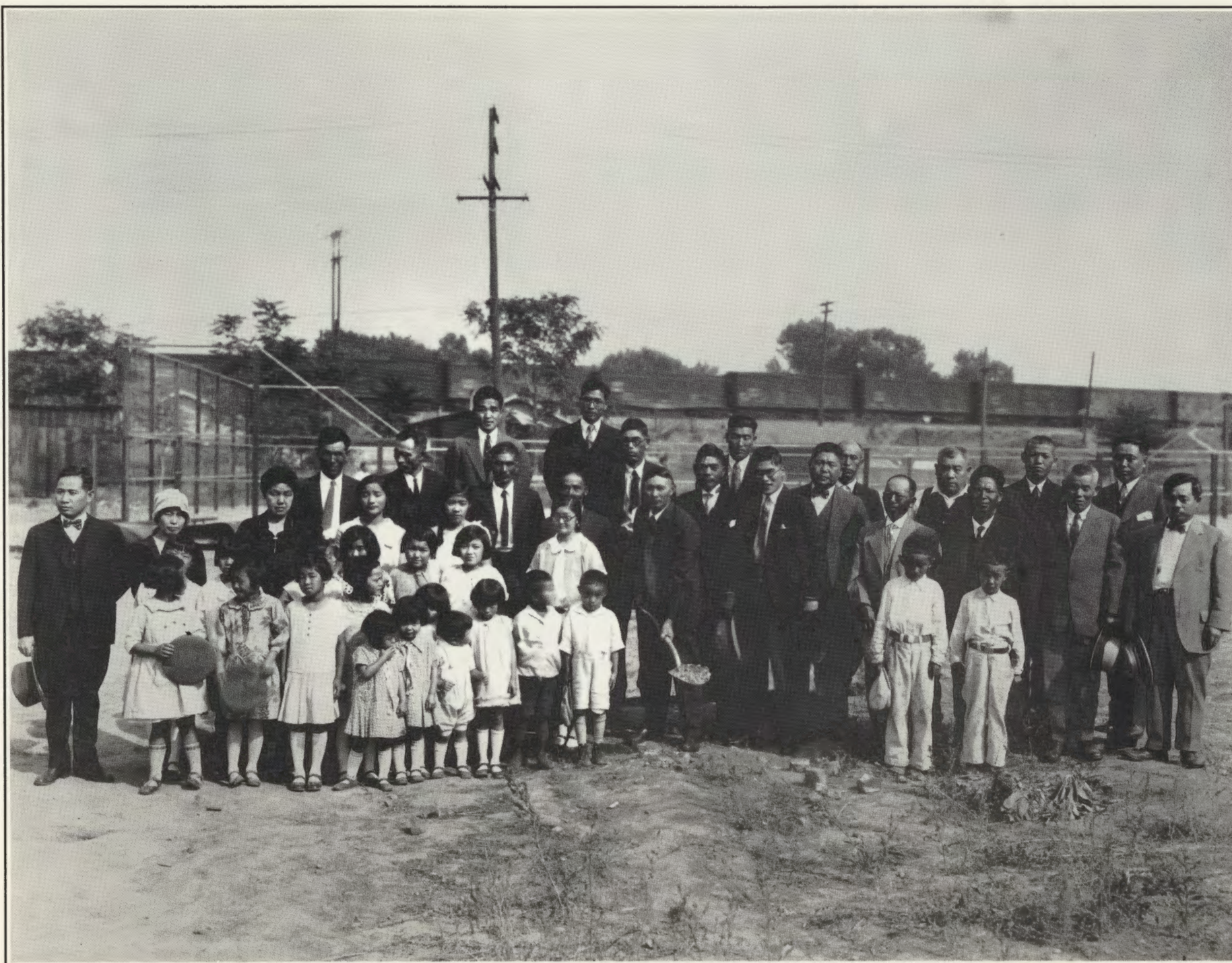
Turning of Sod in 1926 for Construction of Marysville Japanese School Building at 115 B Street