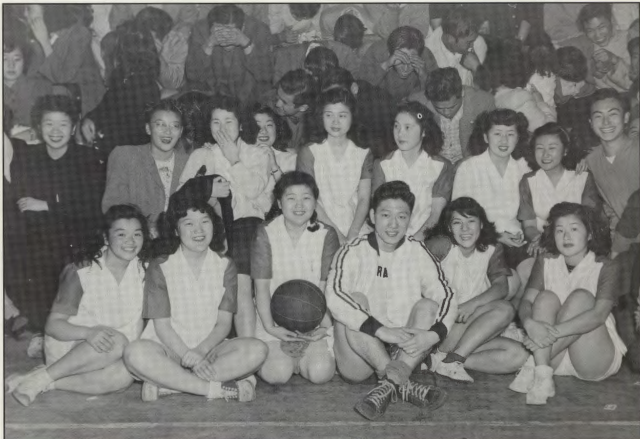
Perennial Post War Powerhouse Sacramento YBA Saints