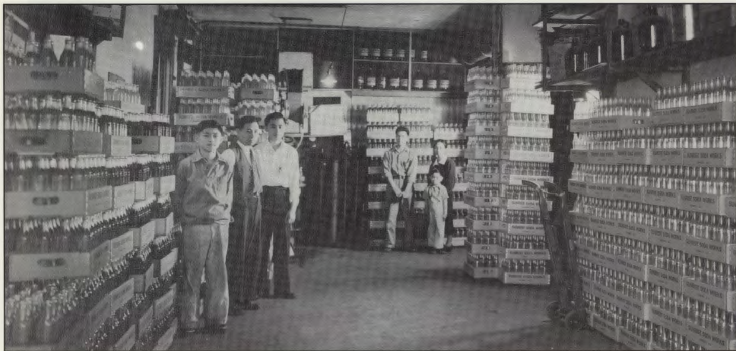
Mayeda Family's Sunrise Soda Works