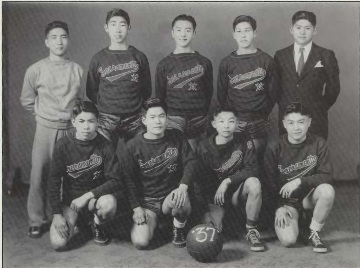
Sacramento Mikados 1937