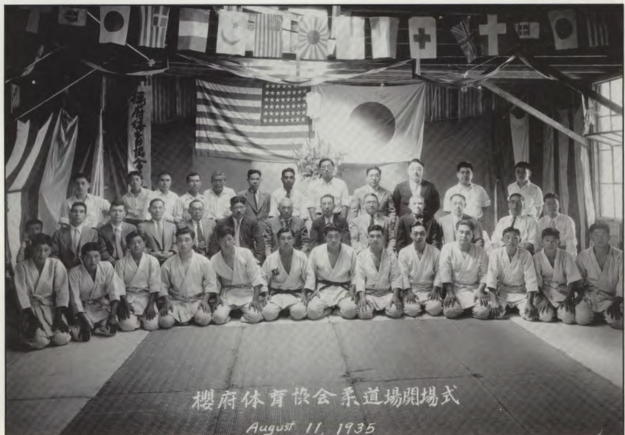
Sacramento Taiiku Judo Club 1935