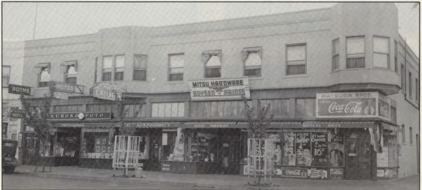
Corner of 4th St. & M St.