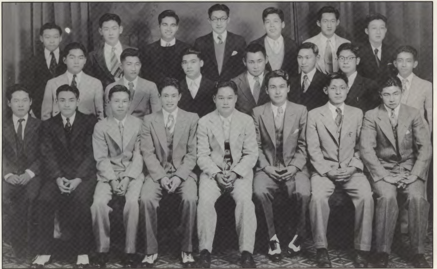
Sacramento Jr. College Men's Club 1930's