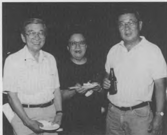
Enjoying mixer food.