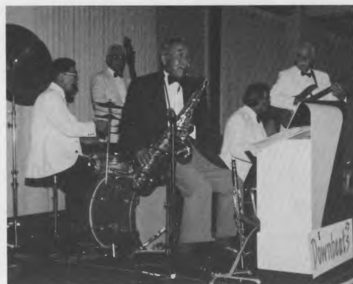
"Downbeats" playing at Tulelake mixer.