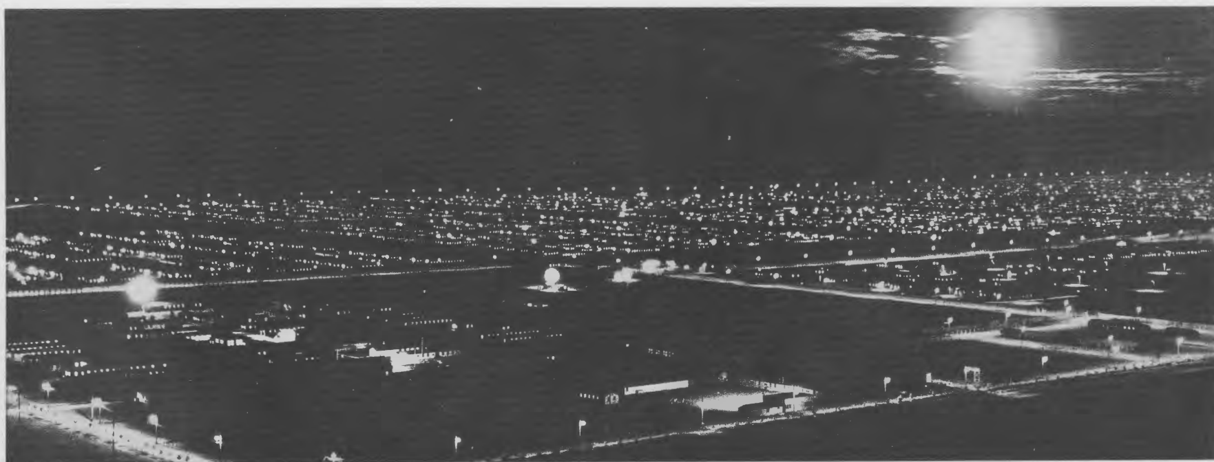
Panorama view at night.