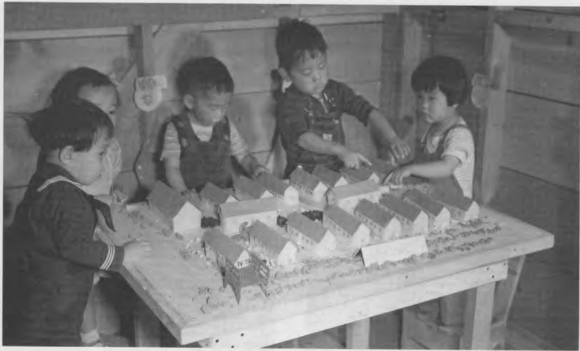
Pre-school kiddies in action.