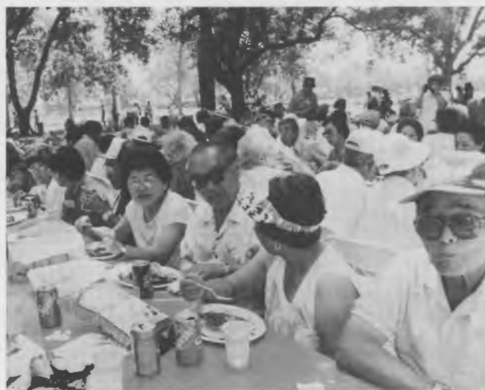
Part of crowd feasting on chicken and ribs at picnic.