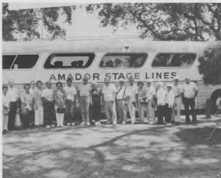
Shuttle bus arriving from hotel to Elk Grove Park, site of picnic.