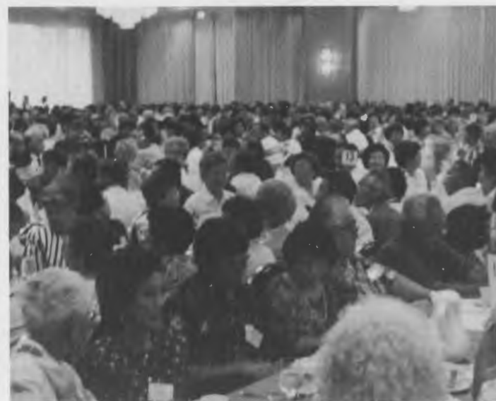
Part of crowd at mixer.