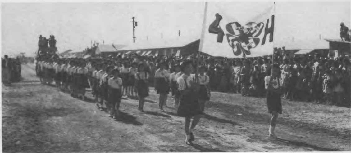
4-H kids on parade.