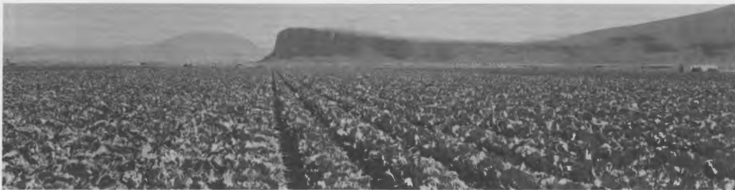
Tulelake coop farm.