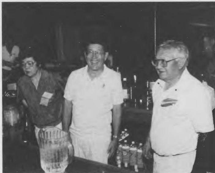
Bartenders at mixer.