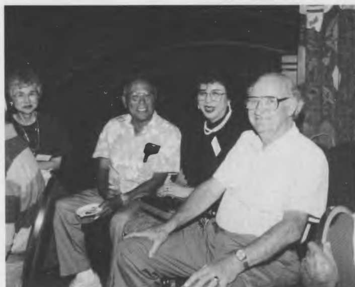
Socializing at mixer.