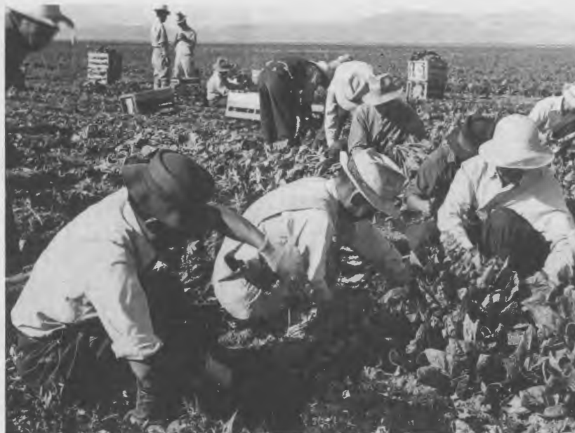
Bountiful harvest Tulelake coop farm.