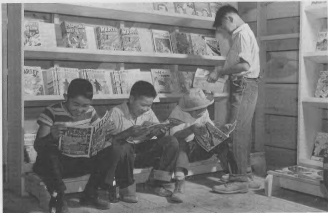
Comic book scholars.