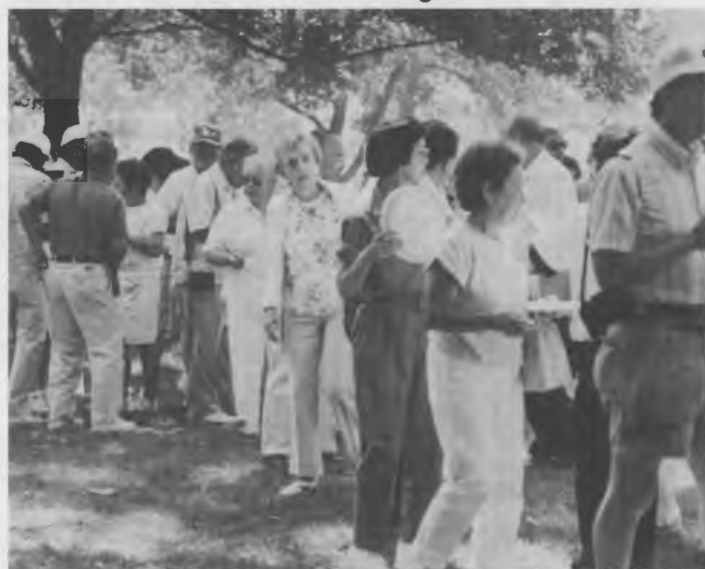
Chowline at picnic.