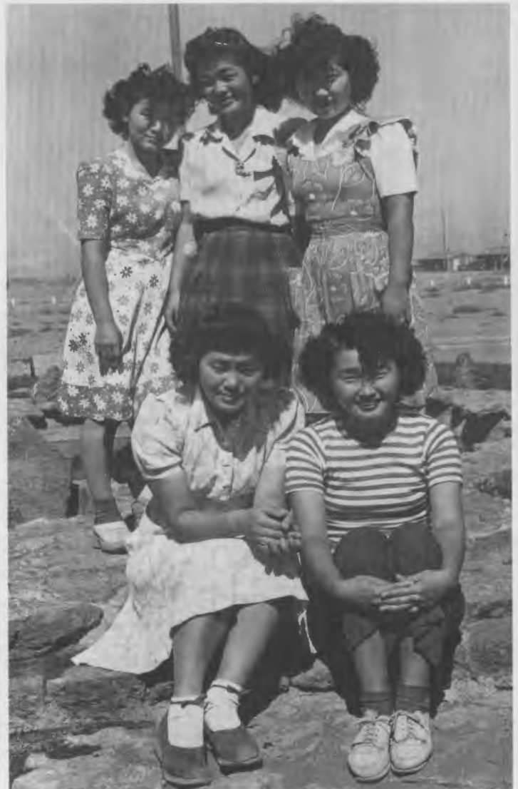
Bevy of beauties.