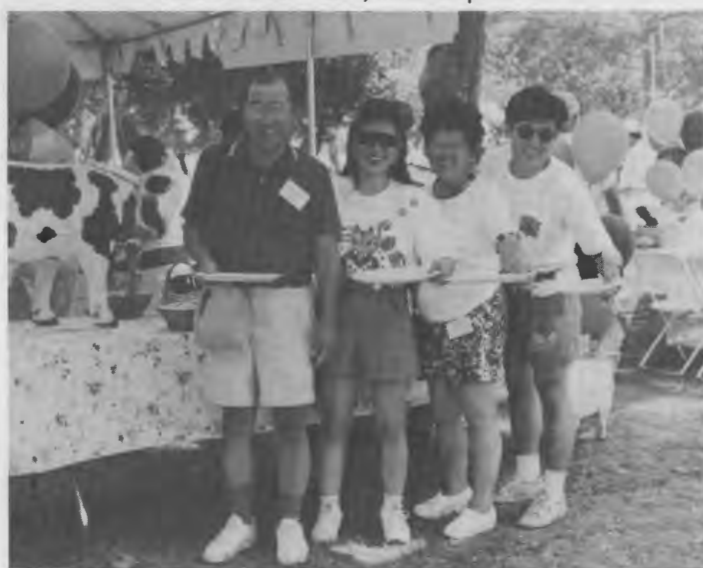
Chowline at picnic bar-b-que.