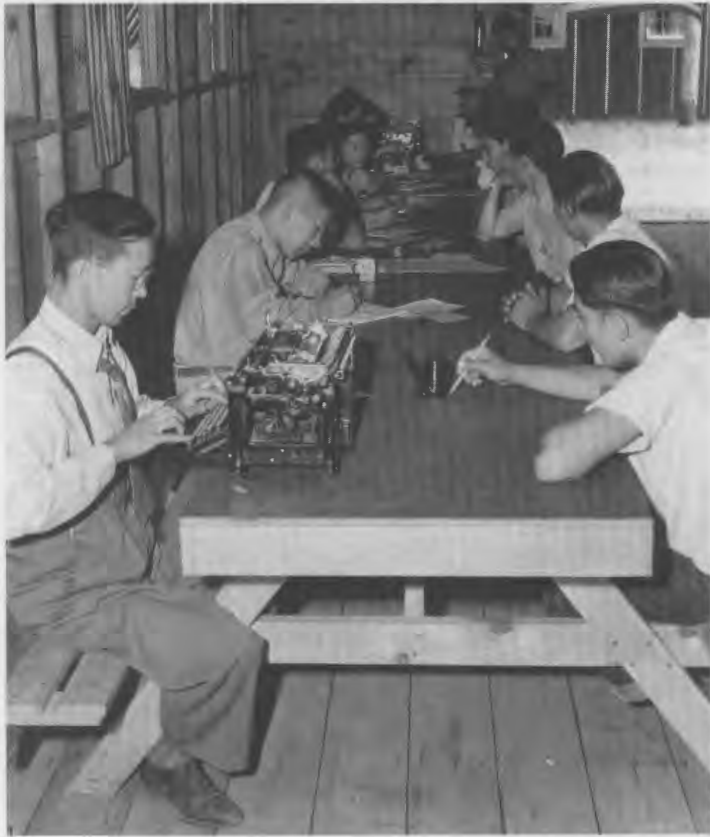
Signing up for selective service.