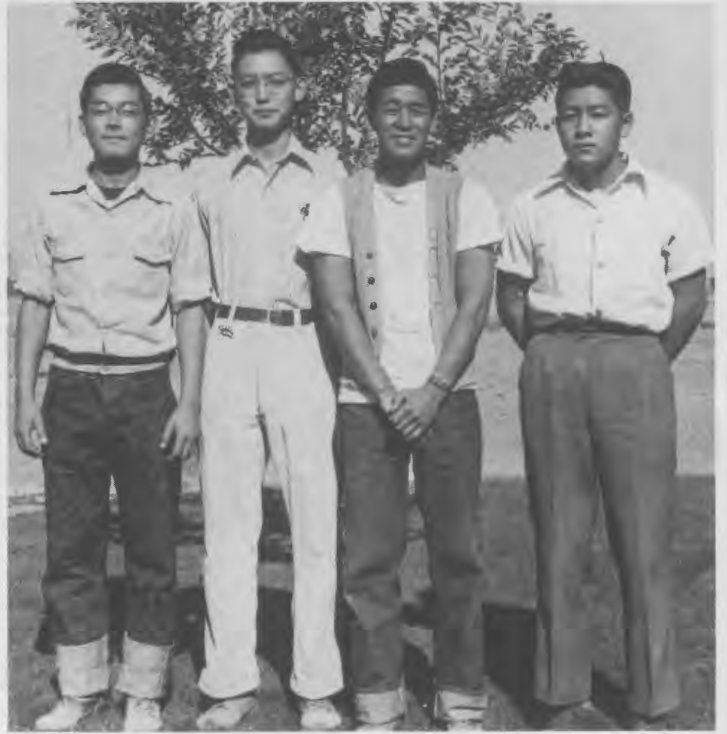
Young men ready to face the world.