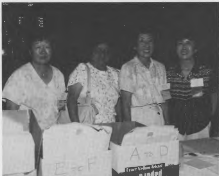
Part of Registration Committee.