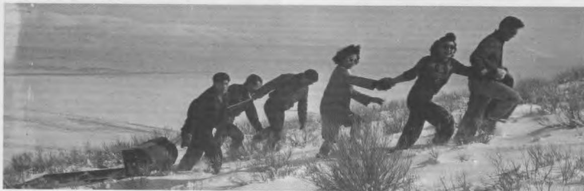
Snow fun up Castle Rock.