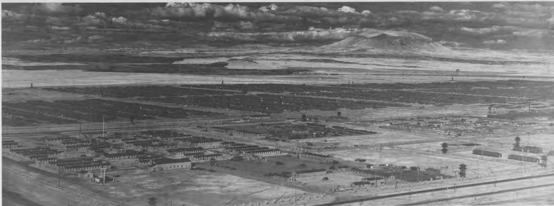
Panorama shot at Tulelake.