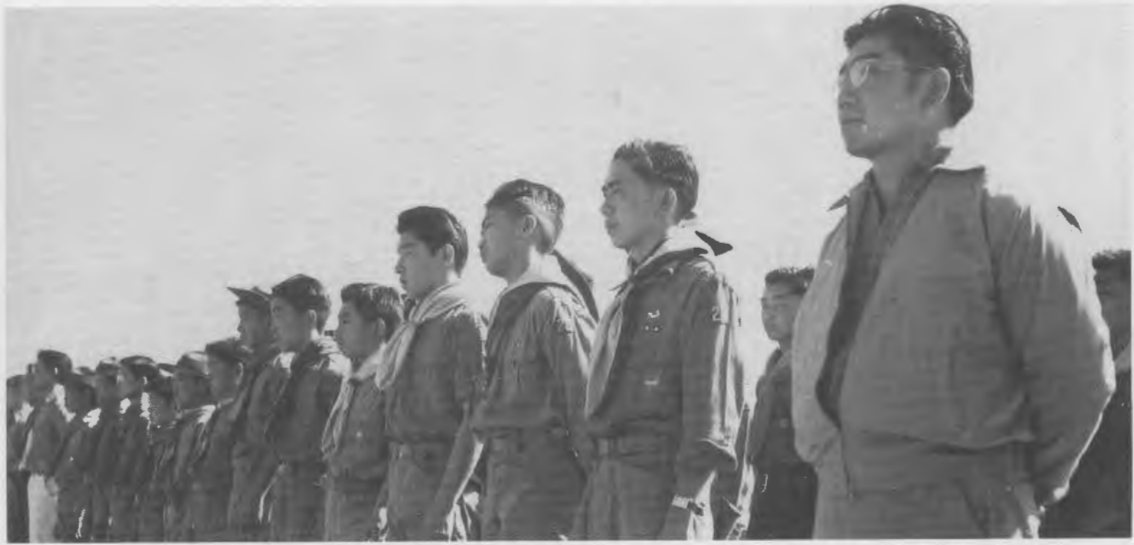
Boy Scouts of America.