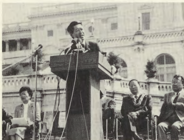
Speaking on West Capitol Steps after signing of Redress Bill, October 1, 1988