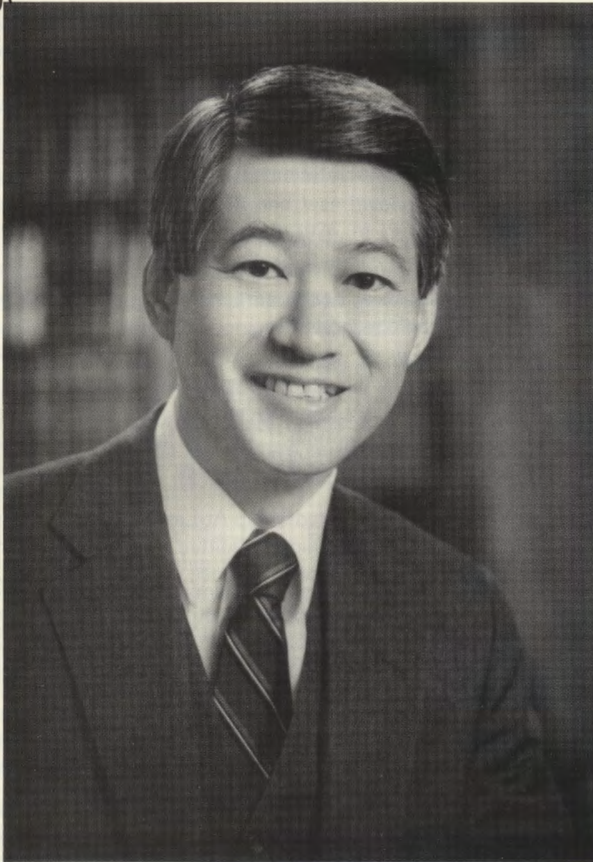
HONORABLE ROBERT T. MATSUI MEMBER OF CONGRESS