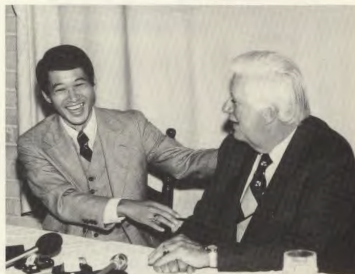
With Speaker Tip O'Neill, 1978