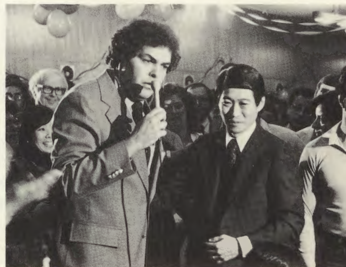
Interview during victory celebration