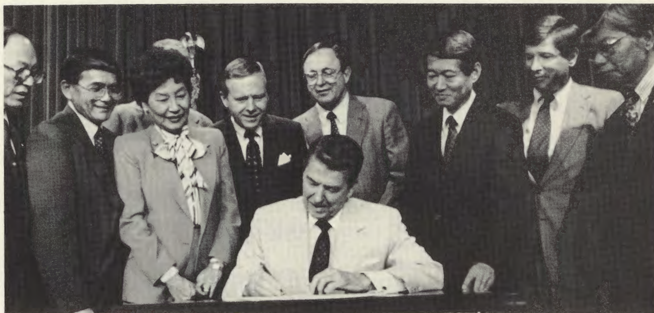
Signing of Redress Bill, October 1988