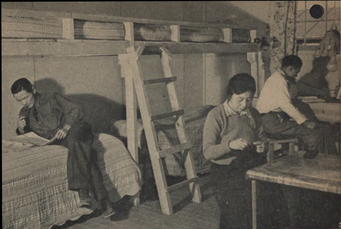
Improvements in family living quarters are made by the evacuees themselves from scrap materials.

The specific procedures being followed have been approved by the Department of Justice as sound from the standpoint of national security and have been endorsed by the War Manpower Commission as a contribution to national manpower needs. As the program moves forward, the costs for maintenance of the relocation centers will be steadily reduced.