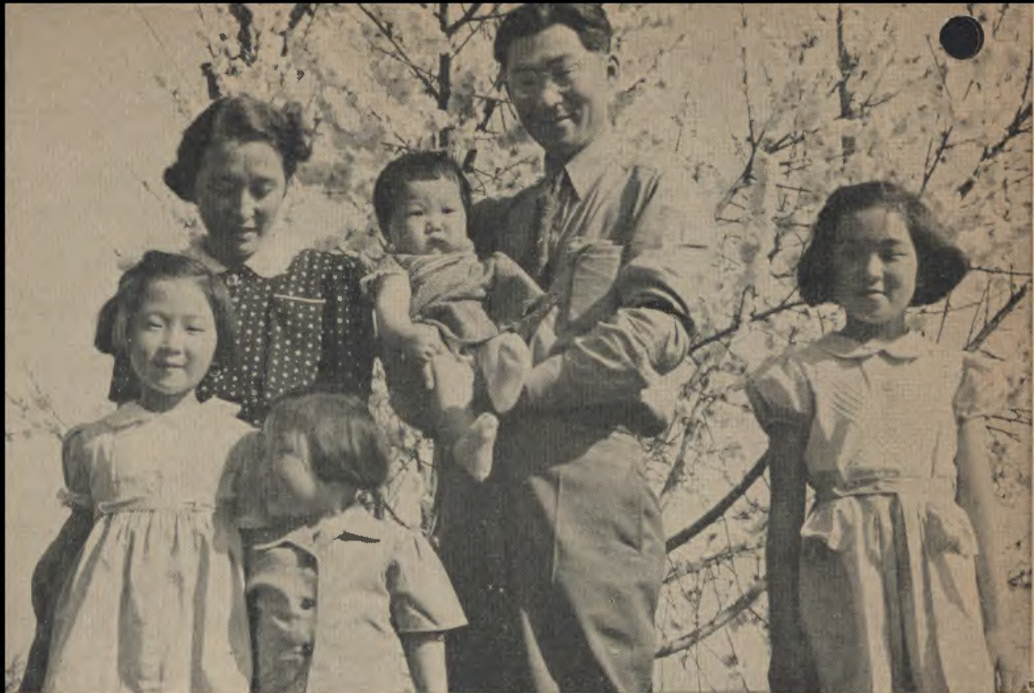
An American family of Japanese descent.

the latter part of March, it had become apparent that such a large-scale exodus could be handled effectively only on a planned and systematic basis. Accordingly, all further voluntary evacuation was halted by the Western Defense Command on March 29 and plans were initiated by WRA for establishing relocation centers with sufficient capacity and facilities to handle the entire evacuated population for as long as might be necessary.