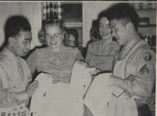
STATESIDE READING of paper for overseas men.