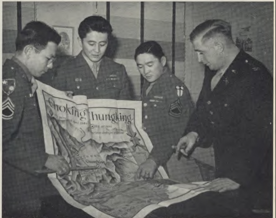
MERRILL'S MARAUDERS vets remember the not-too-distant past.