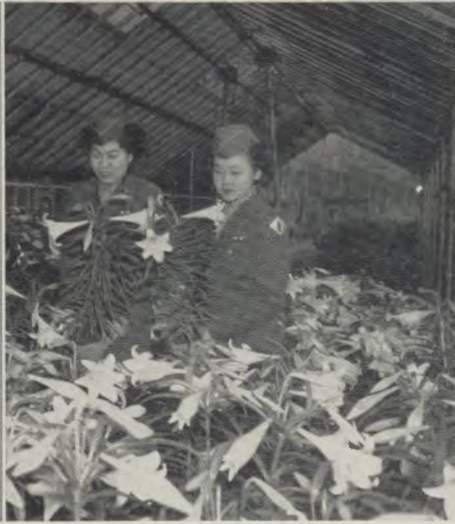
THE BLOOM OF LIFE.