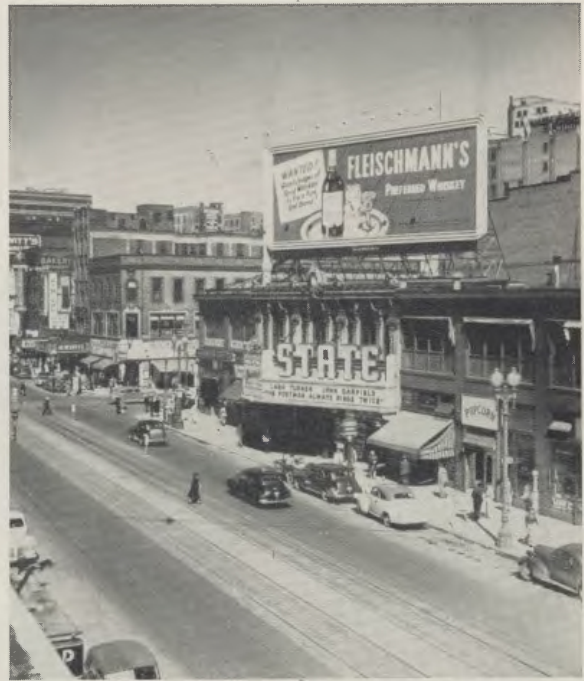
HENNEPIN AVENUE, a daytime view of night-time GI stamping grounds.