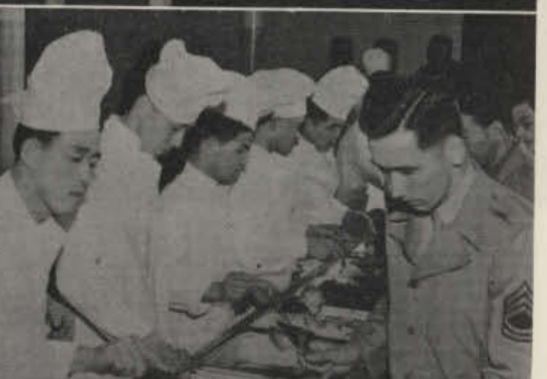
COFFEE AND DONUTS are always welcome.