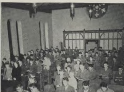
GI'S AND FRIENDS ATTEND services at Post chapel.