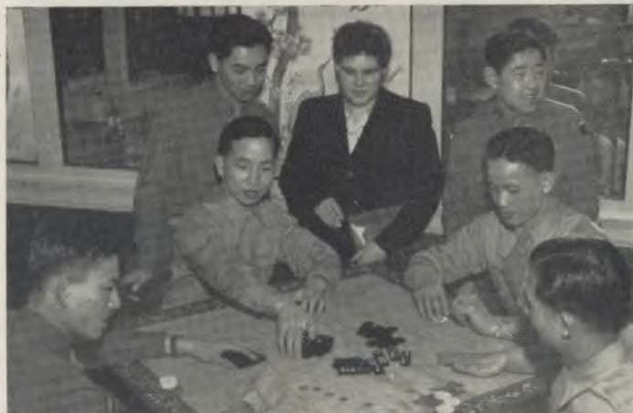
AFTER DINNER at local chop suey house, group relaxes with game of dominoes.