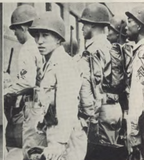
BEFORE BOARDING train to embarkation port, GI casts wistful look.