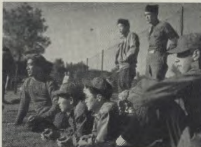
GETTING SOFTBALL pointers from the serious sidelines.