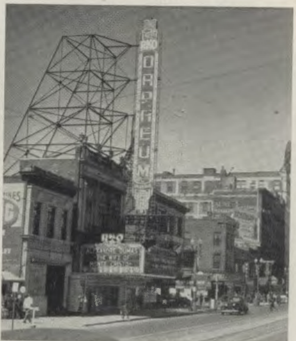
HOSPITALITY HOUSE near Orpheum had free bunks, meals.