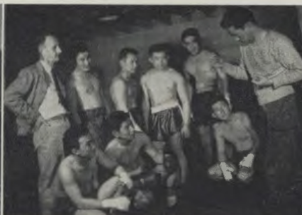
RIGHT HOOK to the jaw is thrown this way, youse guys.