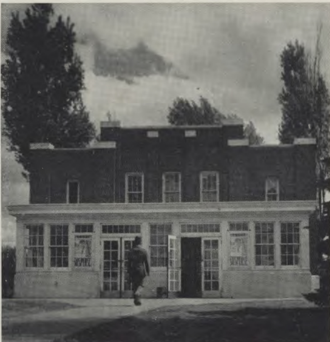
POST THEATER was crowded on weekend evenings and non-study nights.