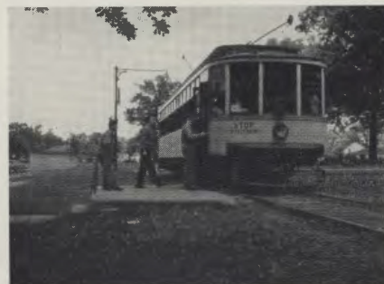
DUMMY-LINE car, although antiquated, was reliable.