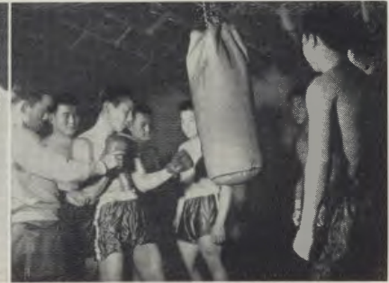
BOXING PUPIL learns how to cock arm for right cross.