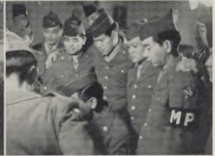
MP's give out with sour notes at song fest.