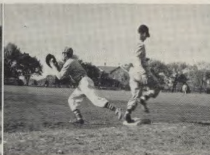
THROW from third base nips runner at first.