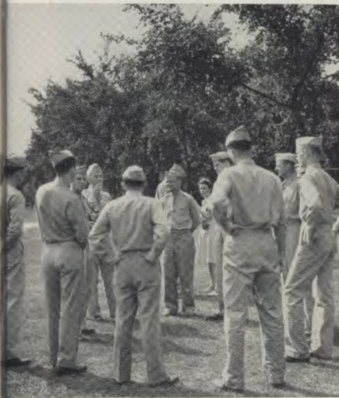
THE BRASSY CROWD and one lady fair.