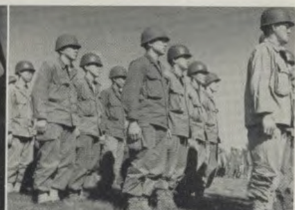
DESPITE BAGGY FATIGUES, men are at attention.