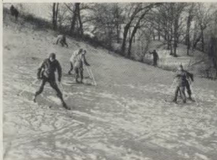
SKI ENTHUSIASTS risk spills on nearby slopes.