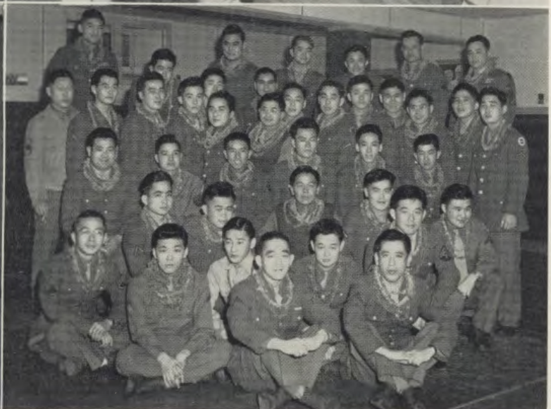
COMMENCEMENT, no more studies! From here on only to draw on the store of knowledge accumulated after nine months of studies.