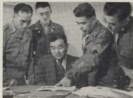
WORLD WAR I VETERANS were also among faculty at Fort.