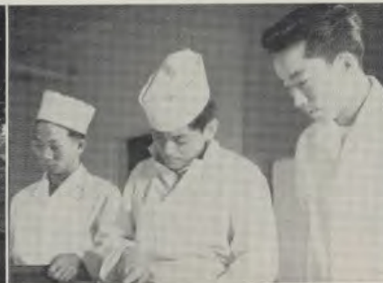
COOKS strove to whet GI's craving for "Nihon-Meshi."