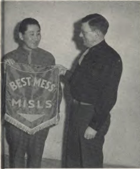
WERE THE BOYS consulted?