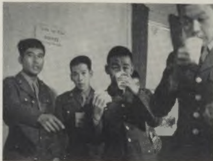
JAVA AT SCHOOL PX helped GI's academic fatigue.