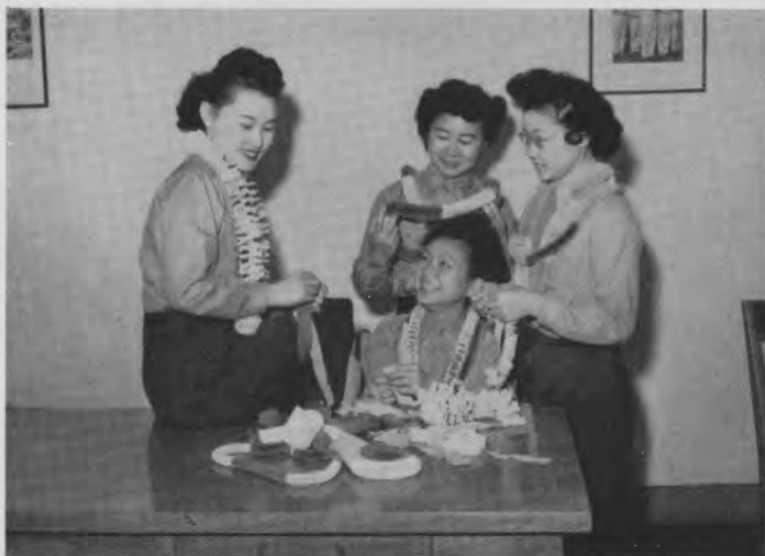
ANOTHER quartet were "eager beaver" hands on the Xmas edition of GOGAI.