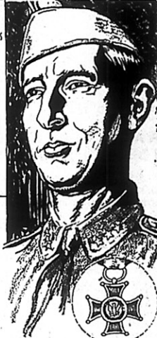
GEN. MARK CLARK, ALLIED COMMANDER-IN-CHIEF IN ITALY RECEIVES HIGHEST POLISH MILITARY AWARD, THE 'VIRTUTI MILITARI'

PATRIOT VIKINGS! NORWEGIAN PATRIOTS OVERPOWERED THE GERMAN CREWS OF 12 SHIPS IN OSLO FJORDS AND FORCED THEM TO ENTER SWEDISH TERRITORIAL WATERS!