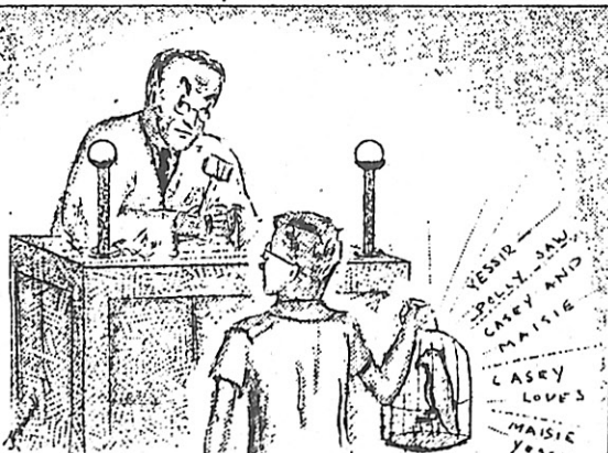
"BESIDES LOSING MY GAL, I'M BEGINNING TO LOSE MY MIND. JUDGE, I'D LIKE TO SUE HIM FOR SLANDER"