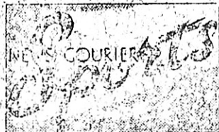
Dec. 22, 1943 Pg. 5