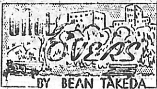
BY BEAN TAKEDA