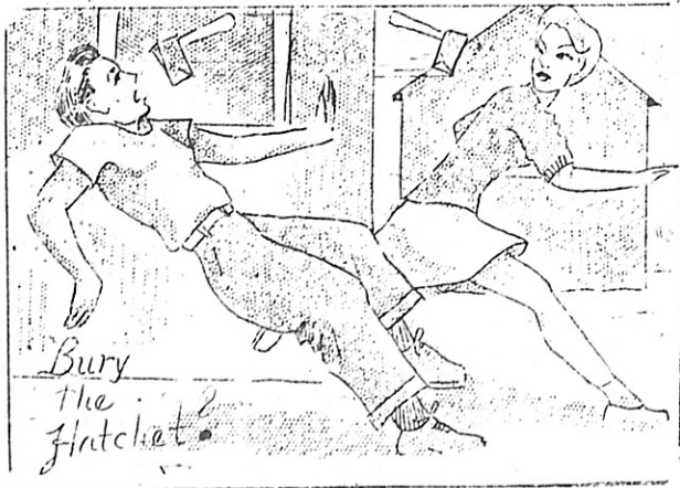
Bury the Hatchet!