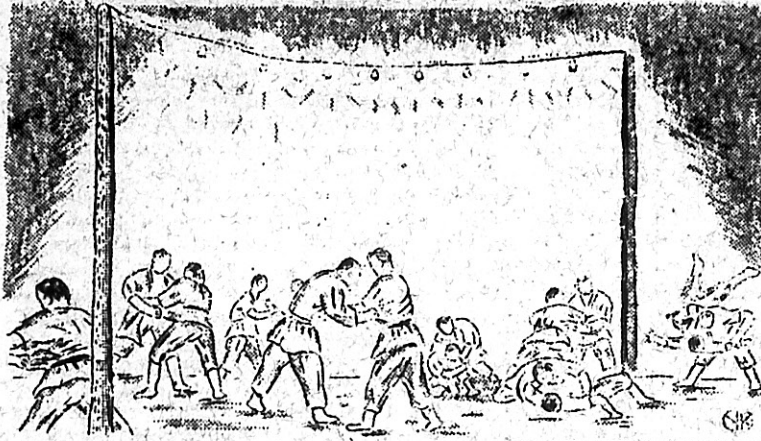
JUDO SCENE --At the judo arena at the north end of Block 22, about 75 boys from 8 to 25 learn the rudiments of self defense on week nights under the temporary coaching of Masayoshi Fukute with a group of judanshas