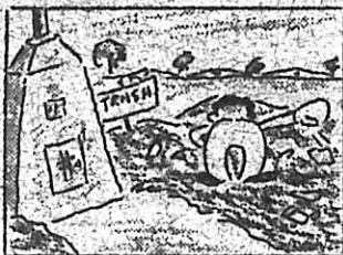
of the main track, for fire-