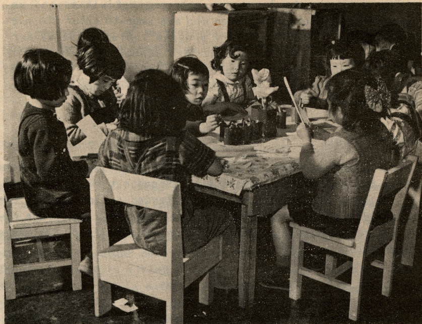
Group activities combine interest and learning.

early days of War Relocation Authority many of these teaching assistants were college graduates and a few of them had made special studies of pre-school education. Since most of these teachers relocated early, classes have been held to help English speaking mothers and recent high school graduates qualify as nursery school instructors. These instructors evinced much interest in and in some cases specific aptitudes for nursery school work.