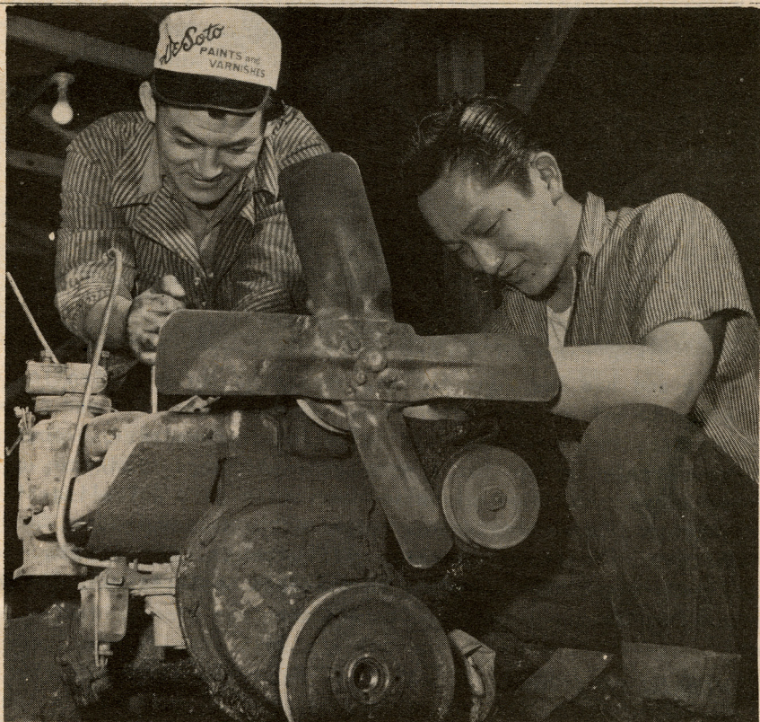
Typical of Industrial, Commercial, Homemaking, and Agricultural vocational courses in the High Schools.

In some instances the school day was divided into hour and in other cases fifty minute class periods.