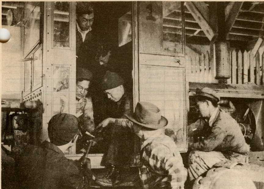
Tractor Repair and Maintenance: One of the many vocational courses for adult men and women.

Originally it was necessary to work out with the War and Navy Departments and other agencies procedures for clearance of students from relocation centers and colleges which they might attend. In August 1944, all restrictions were removed.