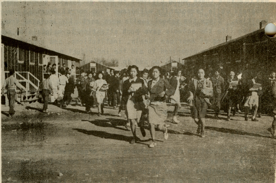
A group of evacuee students changing classes.

The evacuation brought to the War Relocation Authority centers many families who resented the evacuation and many pupils and parents who were dismayed in new and strange surroundings. There was much discouragement. The school, an institution with which the people were familiar, and which served as a connecting link with the cherished past could now be extended to link the present to the anticipated future, to arouse new hopes, and to combat apathy and resignation.