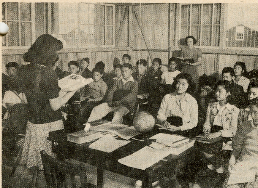
A ninth grade group conducting regular classroom activities.