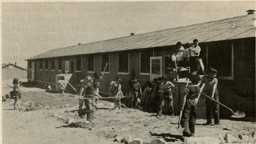
Elementary pupils planned and carried out a landscape program, later resulting in a thriving greenery near their school building.

Class and club organizations provided opportunities for democratic participation. Special interest and dramatic clubs gave an opportunity for self expression. Where facilities were available visual education opportunities were provided.