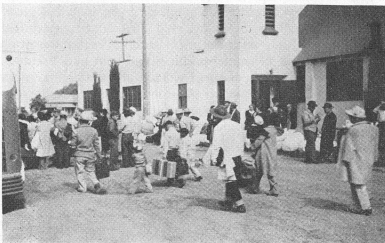
Santa Maria, April 30, 1942—Heading for Tulare Assembly Center.