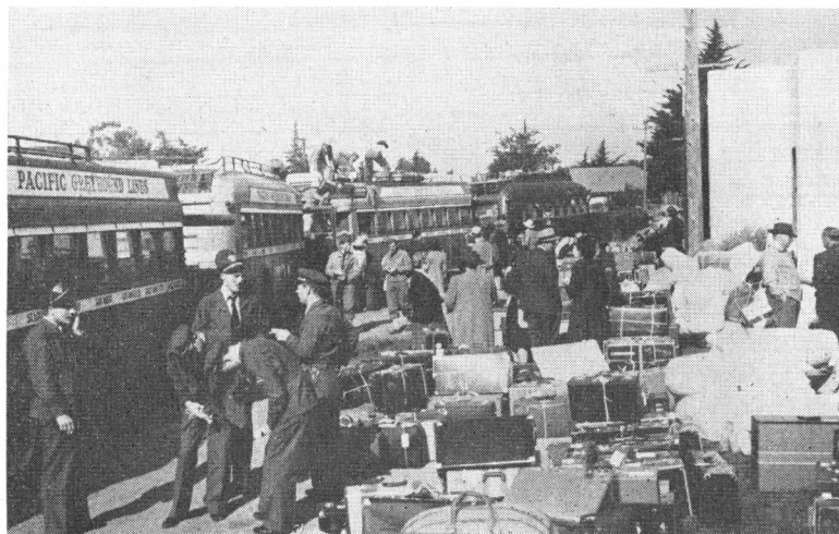
Santa Maria, April 30th evacuation of Japanese-Americans and their parents.

few of them, particularly the citizens, managed to construe the eviction as "Part of our sacrifice in the interest of national security and winning the war." Wrenched loose from all their moorings, they are resolved to show that they, too, like earlier American pioneers, can defy the slings and arrows of outrageous fortune. For the older generation, the evacuation is pathetic to the point of tragedy.