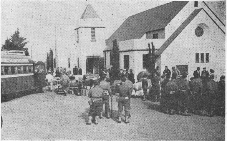
At the Santa Maria Japanese Union Church—On guard.

of doing everything too late that has had such tragic results for the democracies, the civilian has little right to criticize the army for acting on the basis of the worst possible contingencies. Moreover, there is a case in favor of evacuation as the only sure means of protecting the Japanese themselves from mob violence if there should be raids upon our coast. We must distinguish between the issue raised by the evacuation from coastal areas and the question of future policy. Even if this evacuation was necessary, it is still a very evil thing to deprive American citizens of all of their liberties by administrative fiat, without due process of law. Whatever is to be said about the government which has adopted this policy with obvious reluctance, there is no doubt that a large part of the public deserves condemnation for accepting it with complacency and sometimes for advocating it for selfish motives. Those who have emphasized the military necessity of evacuation as a means of disposing of a minority whose property they coveted or whose competition they sought to remove are themselves the real enemies of America, not the