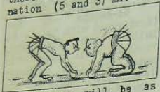
Matches will be as follows:

Hold over from 4th of July, the huge East vs West Sumo Tournament will be staged tonight at 7 p.m. in front of the bleachers. The first hour of the sumo program will be occupied by the children group with the remaining two hours used by the adults. Besides the East vs West matches, there will be five elimination (5 and 3) matches.