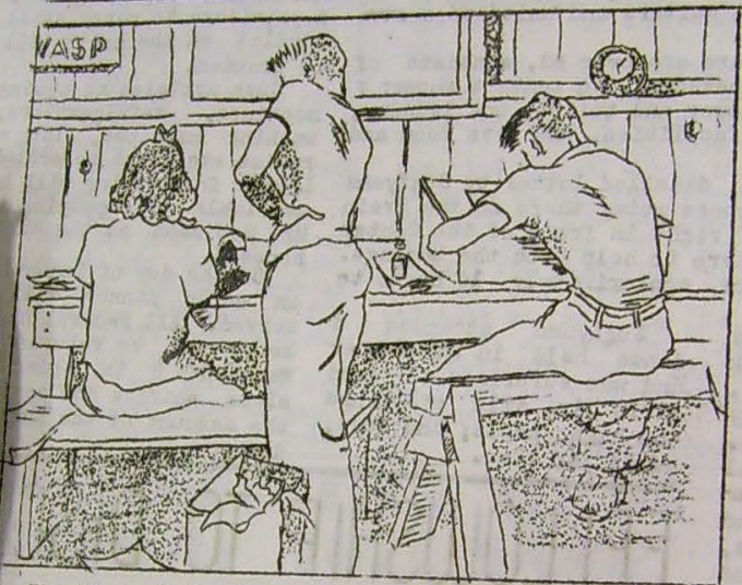
The Wasp staff at work in Warehouse 5..