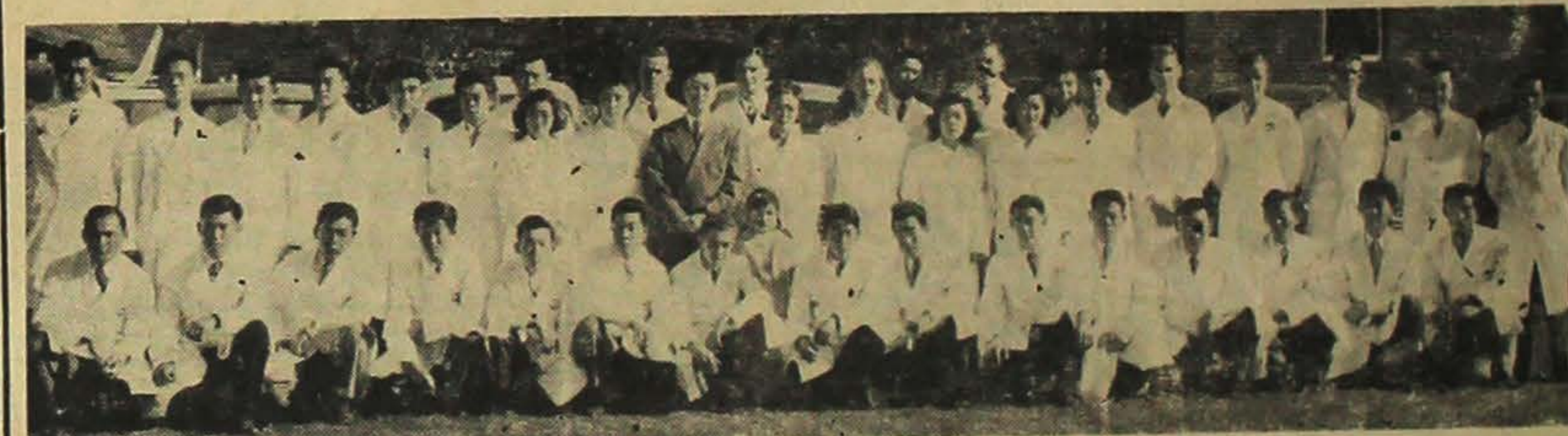
American Chick Sexing Ass'n School—Graduating Class, Fall of 1947

No. 500 NORTH COAST Importing Co. Supply Co. 515 Maynard W. 27 Main Ave. Seattle 4, Wash. Spokane 8, Wash. Tel. EL. 4833 Tel. MA. 3715 DISTRIBUTORS SMITH 500 Blue Rose Rice DAIKOKU Brand Rice MARUSHO Shoya KOKUSUI Shoya TAKA Shoya SHIRAYUKI Ajinomoto HIME Uden TRADE MARK REGISTERED RICE MILL CO. DEWITT, ARK. COATED RICE COATED WITH GLUCOSE AND TALC. REMOVE BY WASHING BEFORE COOKING 100 LBS. NET