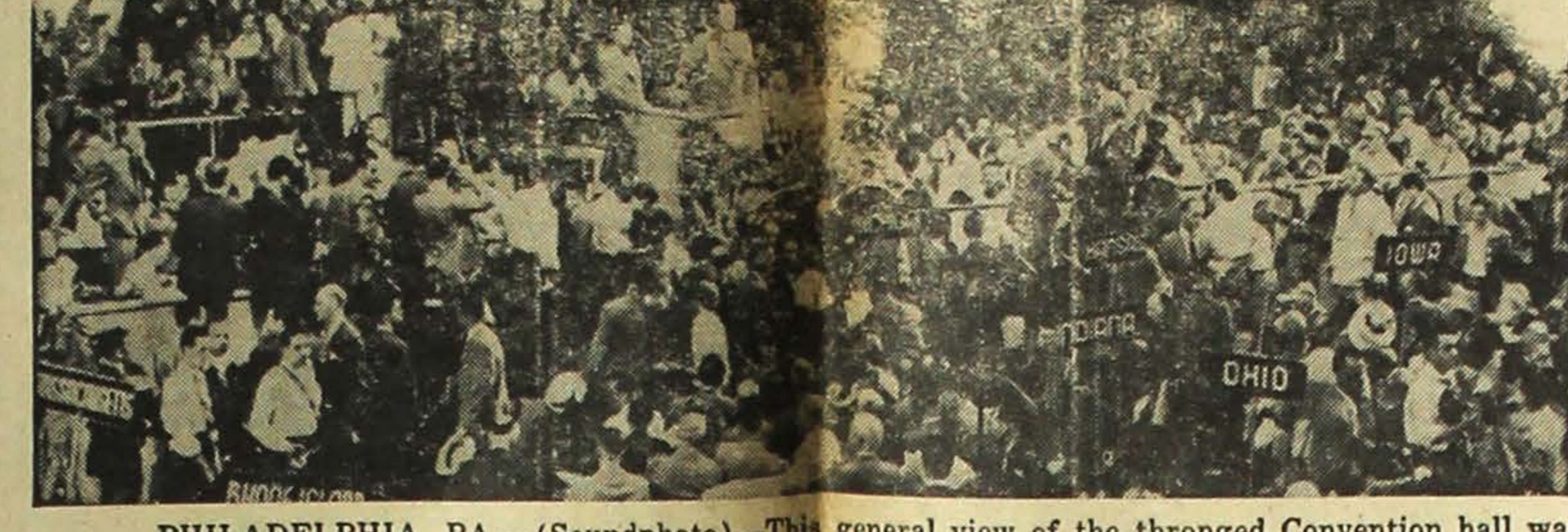
PHILADELPHIA, PA.—(Soundphoto)—This general view of the thronged Convention hall was taken at the official opening of the GOP drive for the presidency. It will soon be duplicated by the Democrats.