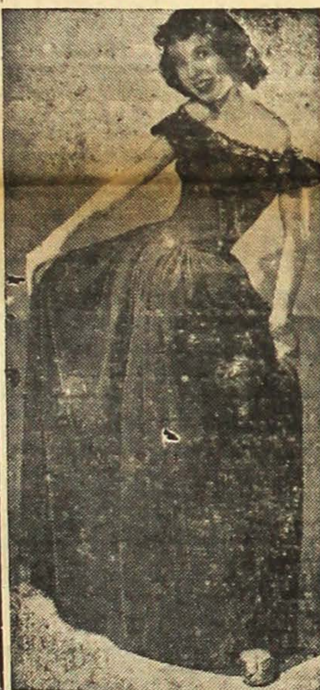
teen evening dress

Fashion excitement made at home... velvet teen formal. Rely on your local Singer Sewing Center for helpful hints.