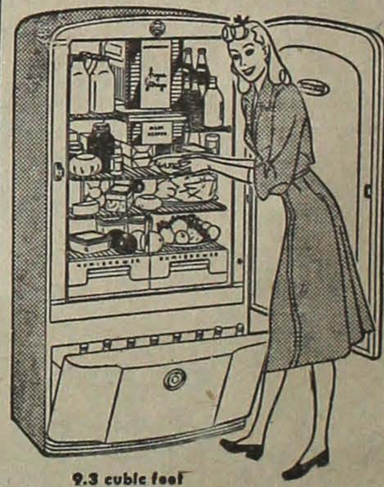
9.3 cubic feet