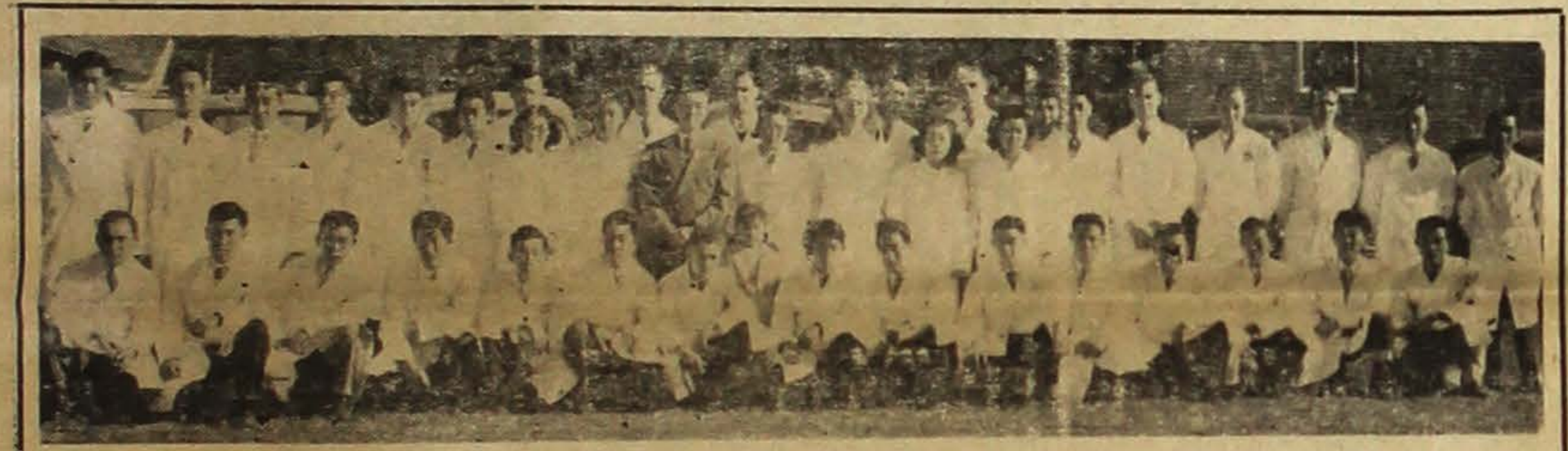
Part of the School-Trained American Chick Sexing Association Staff

LEARN CHICK SEXING HIGH PAYING Jobs Guaranteed to all Graduates AMERICA'S: LARGEST MOST RELIABLE CHICK SEXING SCHOOL Learn under the G. I. Bill of Rights. Earn from $6.00 to $12.00 an Hour. Our Graduates are Located throughout this Country as well as in Latin America, Europe, and Hawaii. Only School in America Operating Every Year since 1937. Applications Now Being Accepted. Enrollment Limited. Write TODAY for Full Particulars.