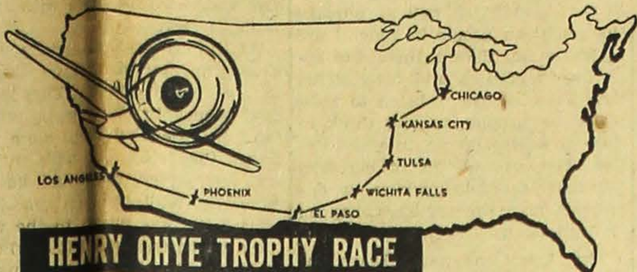
HENRY OHYE TROPHY RACE

Wednesday, Sept. 27 "FATHER WAS A BACHELOR" and "NORTHWEST OUTPOST"