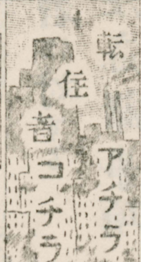
転住 アチラ 善コチラ

が全部撤廢されたこと ぶわけではなく、移転に 際しては、ラウデルヌア の司法省移民歸化局外 人登録部に新住所を通 告し、なけれはならず 且つ外人登録証は常に 携帯すべきであることさ れてゐる。(右住所変更届 書式は各郵便局に備へ つけてある)