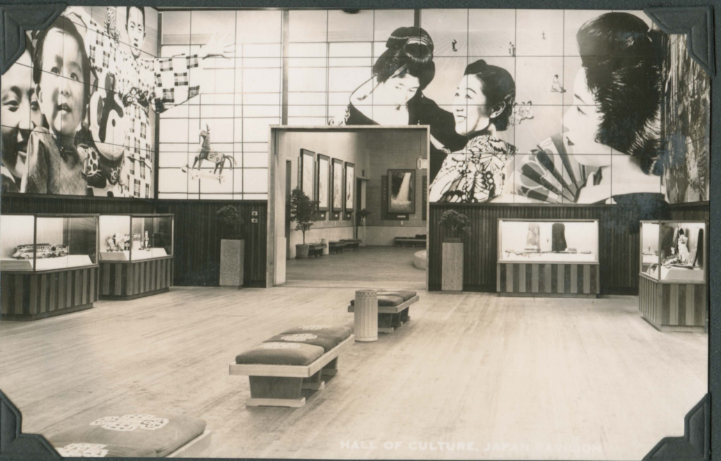
HALL OF CULTURE, JAPAN PAVILION