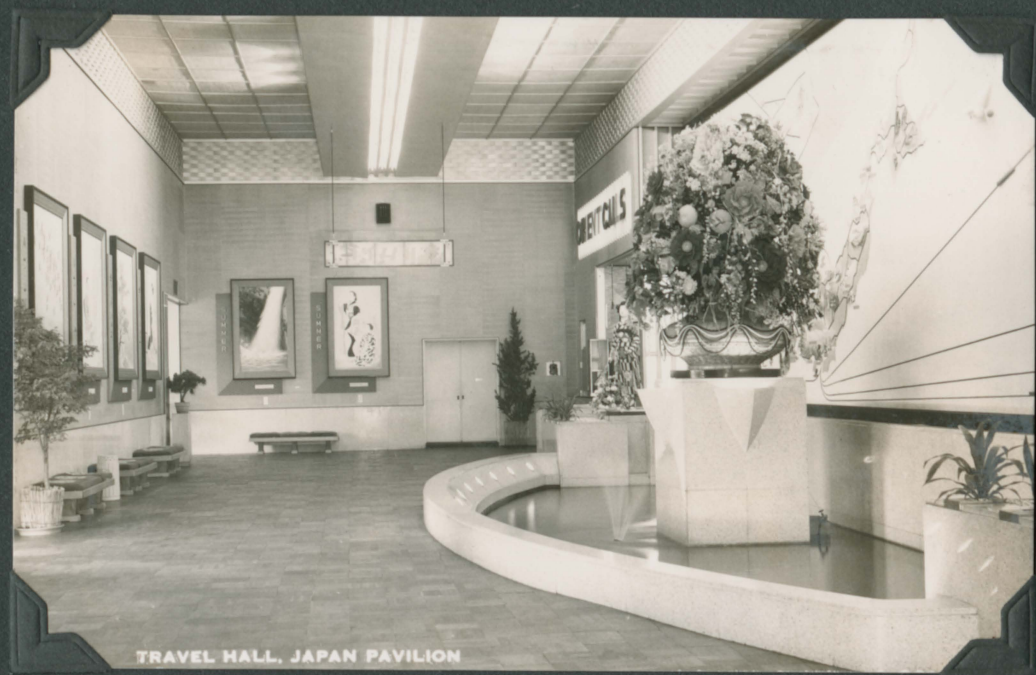
TRAVEL HALL, JAPAN PAVILION