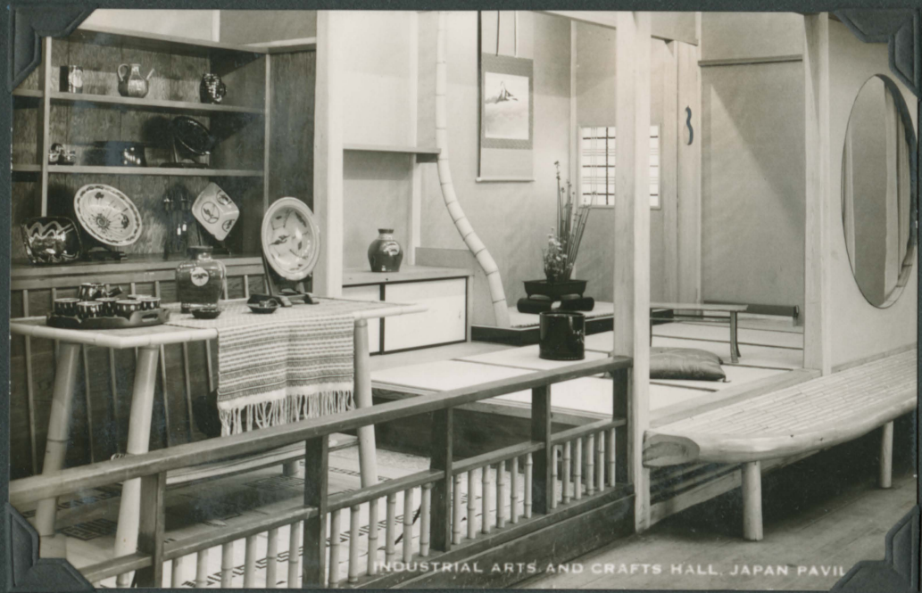
INDUSTRIAL ARTS AND CRAFTS HALL, JAPAN PAVILION