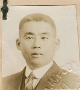
Photograph of the Bearer.

This is to certify that the above is a true and correct translation of the original document which is written in Japanese and which is attached hereto.