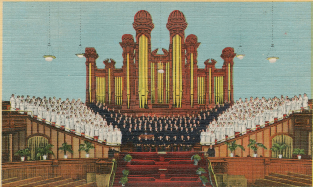
905 The Tabernacle Choir and Organ, Great "Mormon" Tabernacle, Salt Lake City, Utah