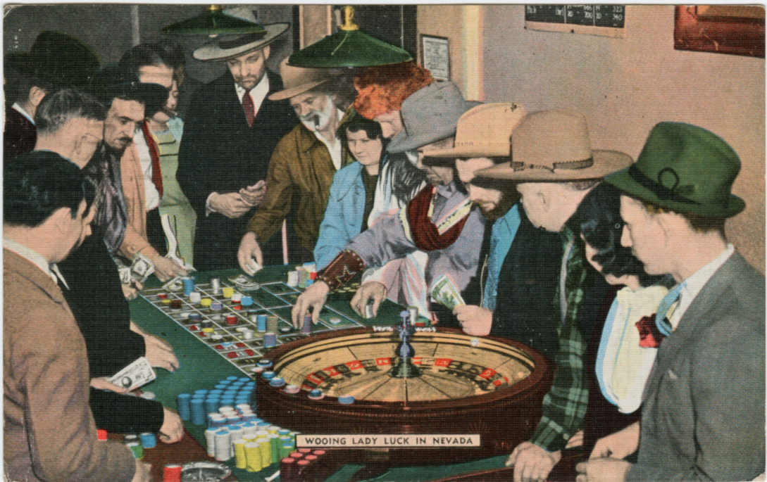
WOOLING LADY LUCK IN NEVADA