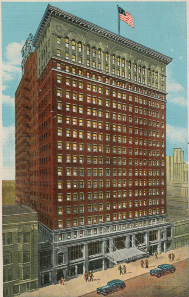
YMCA HOTEL — CHICAGO