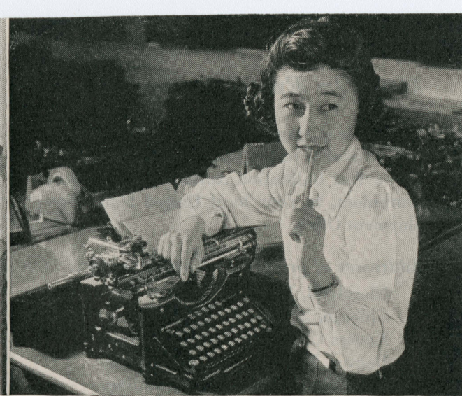
A considerable number of secretaries, stenographers, and other clerical workers are available for employment outside the relocation centers.