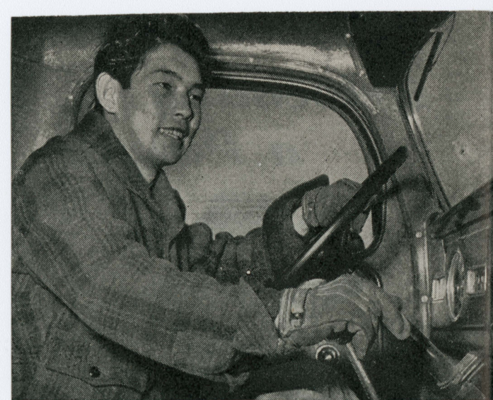
Relocation center residents include trained engineers, mechanics, drivers, shop and mill workers with a variety of skills.