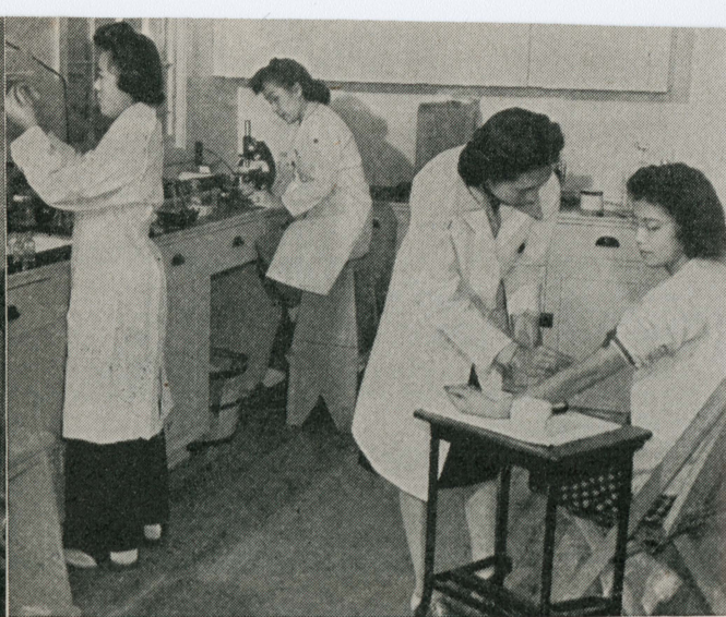
These hospital laboratory workers, and many other technicians with equally important skills, are waiting for opportunities to serve outside communities.